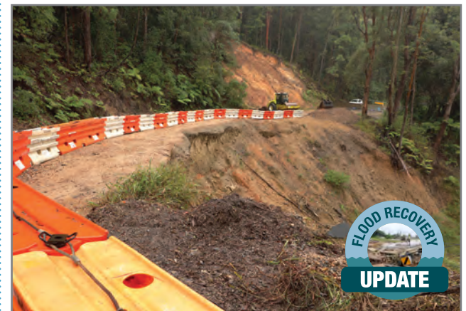
The repair site at the major slip on Reserve Creek Road.

Council is working with others to prepare for, mitigate and build resilience to natural disasters while delivering a safe and connected local road network.