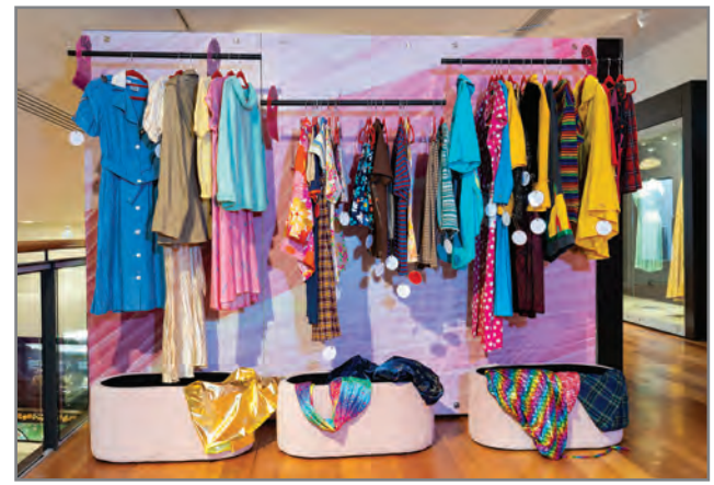
Dress-ups never looked so much fun! Try on some of the clothes on display as part of the Social Fabric exhibition during the GLAM: Red Carpet Party .

For more information or to book your free ticket, visit museum.tweed.nsw.gov.au/events-workshops-activities . This is a free, all ages event.