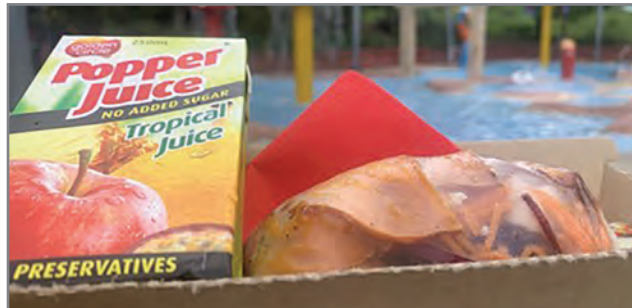
A sample of what's on offer on the new $5 afternoon snack menu at Starting Block Café, TRAC Murwillumbah.

The Starting Block Café is located at the Tweed Regional Aquatic Centre complex at Murwillumbah. Check out the whole menu at trac.tweed.nsw.gov.au/starting-block-cafe