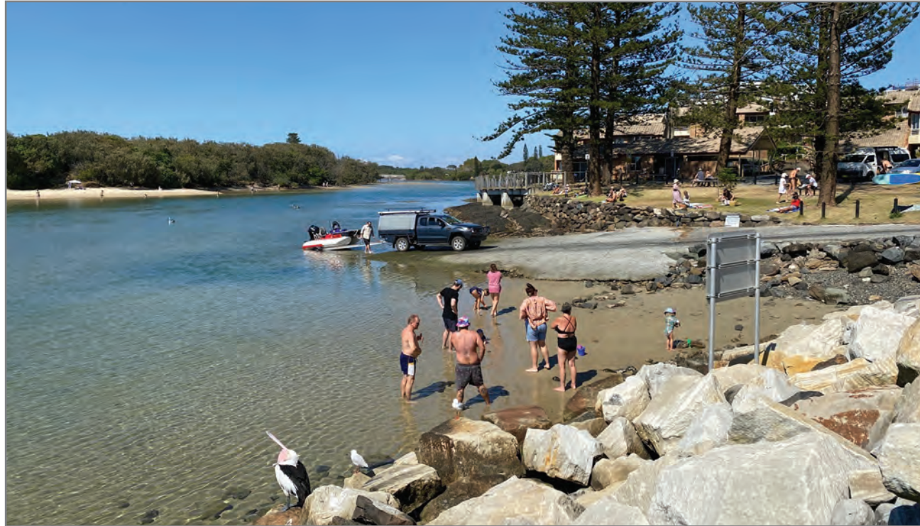
Cooperation is key when using the boat ramp at Cudgen Creek.

Tweed Shire Council wishes to acknowledge the Ngandawal and Minyungbal speaking people of the Bundjalung Country, in particular the Goodjinburra, Tul-gi-gin and Moorung – Moobah clans, as being the traditional owners and custodians of the land and waters within the Tweed Shire boundaries. Council also acknowledges and respects the Tweed Aboriginal community's right to speak for its Country and to care for its traditional Country in accordance with its lore, customs and traditions.