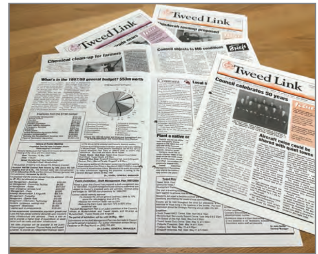
The Tweed Link has been a constant feature for the Tweed community over the last 27 years.