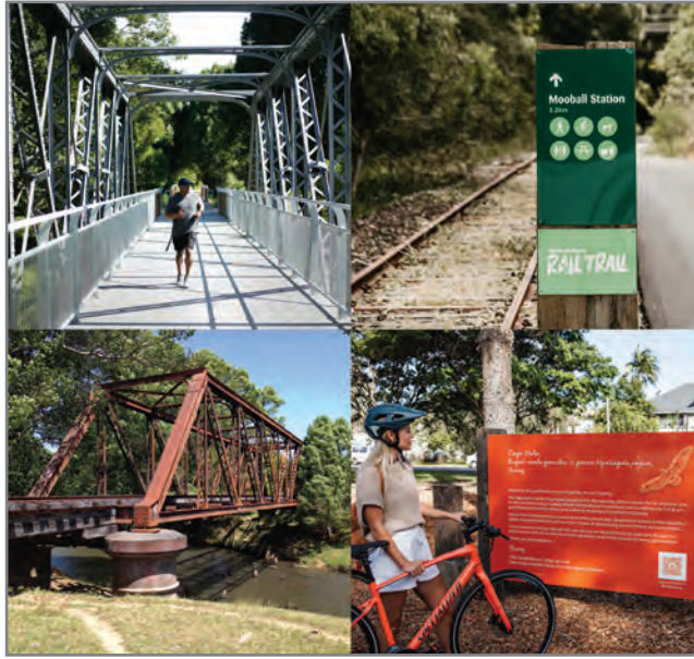
The Tweed section of the Northern Rivers Rail Trail has received a heritage award for its restoration of several bridges and tunnels as well as highlighting the history of local villages and the Aboriginal heritage of the region.