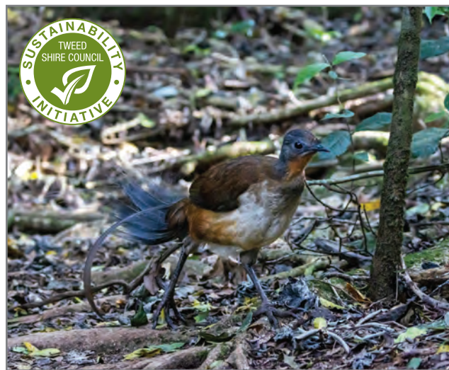
A rare sight! An Albert's Lyrebird captured on camera recently in south-east Queensland.

More information on the project, how to listen for Lyrebirds, and examples of their calls can be found at tweed.nsw.gov.au/alberts-lyrebird