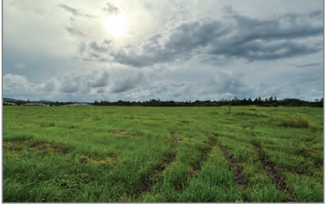
The vacant land at Seabreeze Estate, Pottsville originally earmarked for a high school.

maximise participant's independence so that they can thrive.