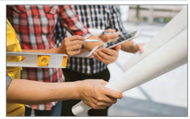
The aim of the industry conference is to connect trades and industry with Tweed Shire Council and other local councils and the NSW Government and get the rebuild underway.