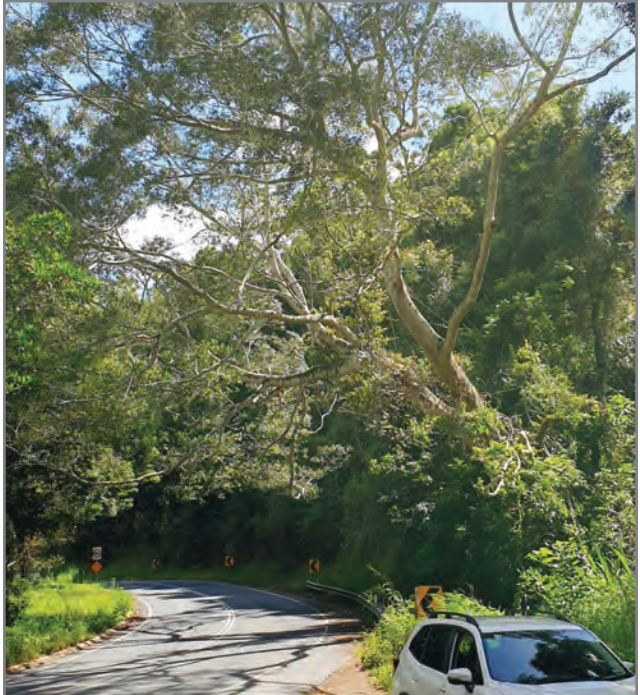
The fig tree to be removed on Kyogle Road

The tree is located at 887/911 Kyogle Road (near Dum Dum) and poses a safety hazard due to the deteriorating