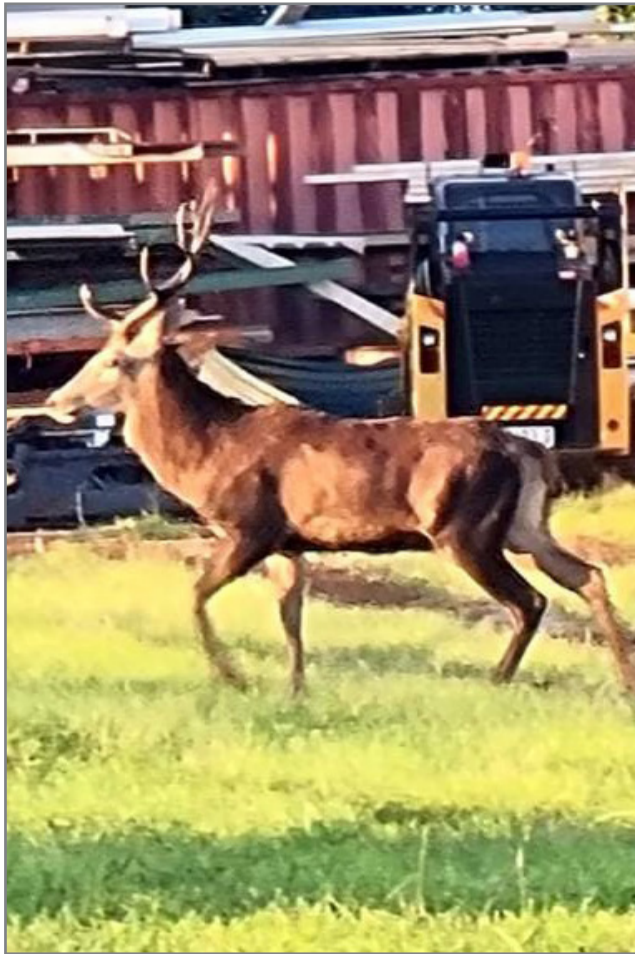
A feral deer captured by a local resident at Cudgen in 2021, proving the species have made the Tweed their home.