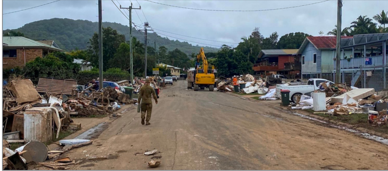
Soldiers help in the clean-up at Tumbulgum after the February 2022 flood. Approximately 500 homes have been declared uninhabitable in the Tweed following the deluge.