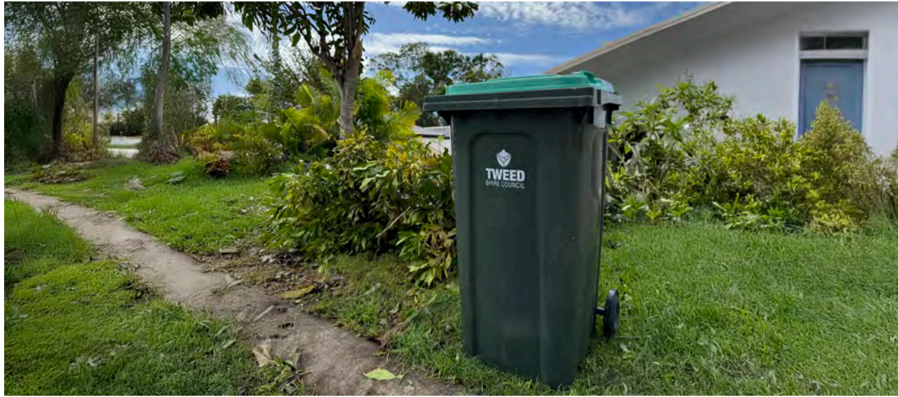
Tweed Shire Council will be providing a clean-up across the Tweed after Tropical Cyclone Alfred wreaked havoc last weekend.