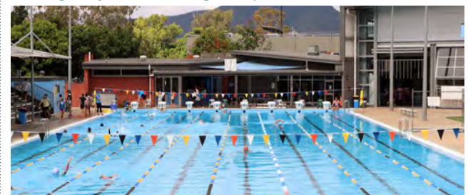
All TRAC centres have now re-opened to the public.

emergency.tweed.nsw.gov.au/services-facilities