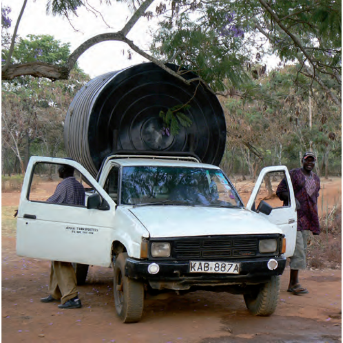
TKMP seeks to provide the people of Tinga, Ochillo and Obambo Kadenge with the information, skills, resources and motivation they need to make positive changes for themselves. [1] The area describing Gona Dam and Tinga Dam users

Access to clean water and effective sanitation is a human right, enshrined for all people in the International Covenant on Economic, Social and Cultural Rights. Providing universal water and sanitation access is also a fundamental objective of the Millennium Development Goals.