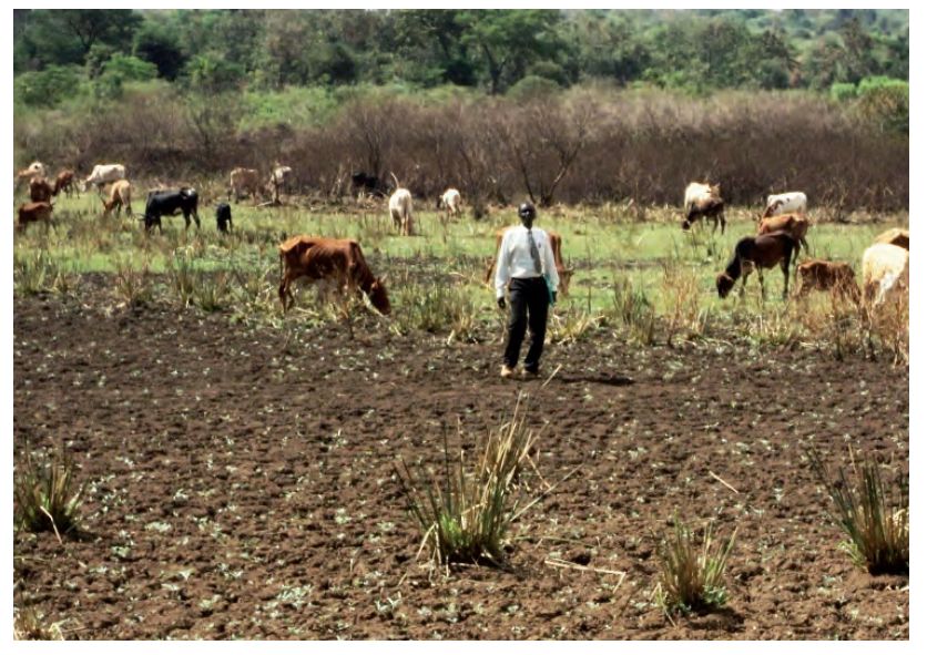
The area where Gona Dam now stands in March 2011 prior to earthworks.