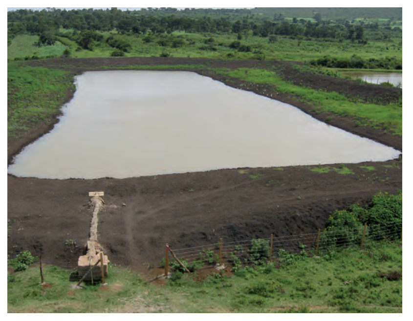
The heart of Gona Dam now - filled with usable water after Safewater 4.