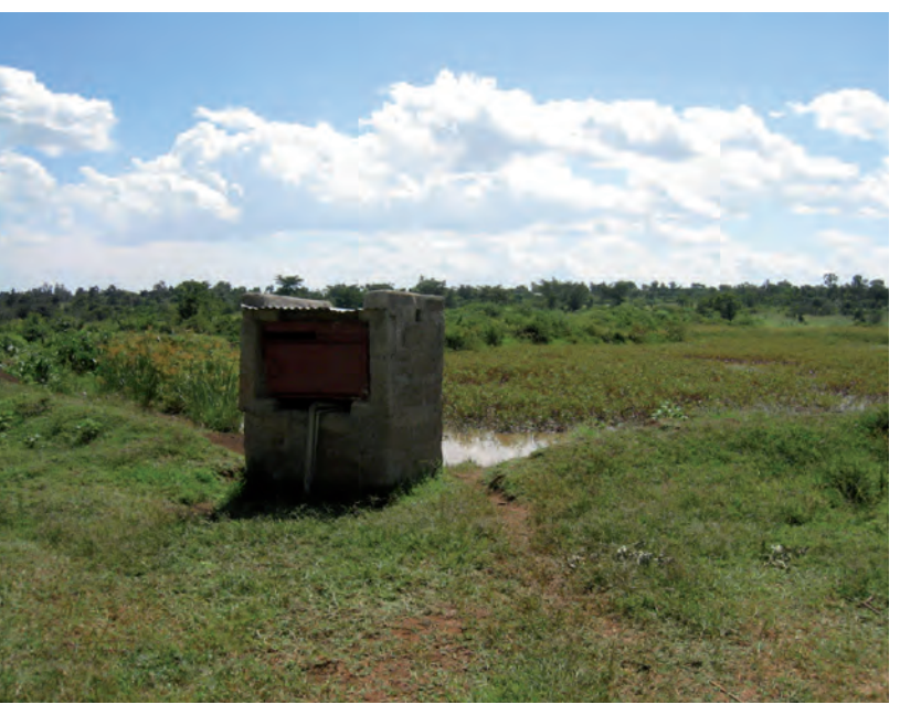
Gona Dam filled with silted water and reeds before the Safewater 4 project.