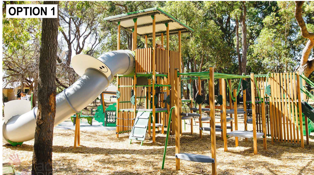
Play equipment (for 2-13year olds) with rubber softfall - OPTION 1