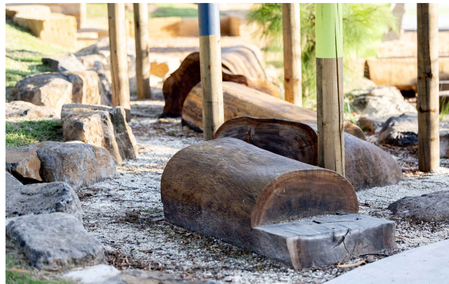
Nature play elements