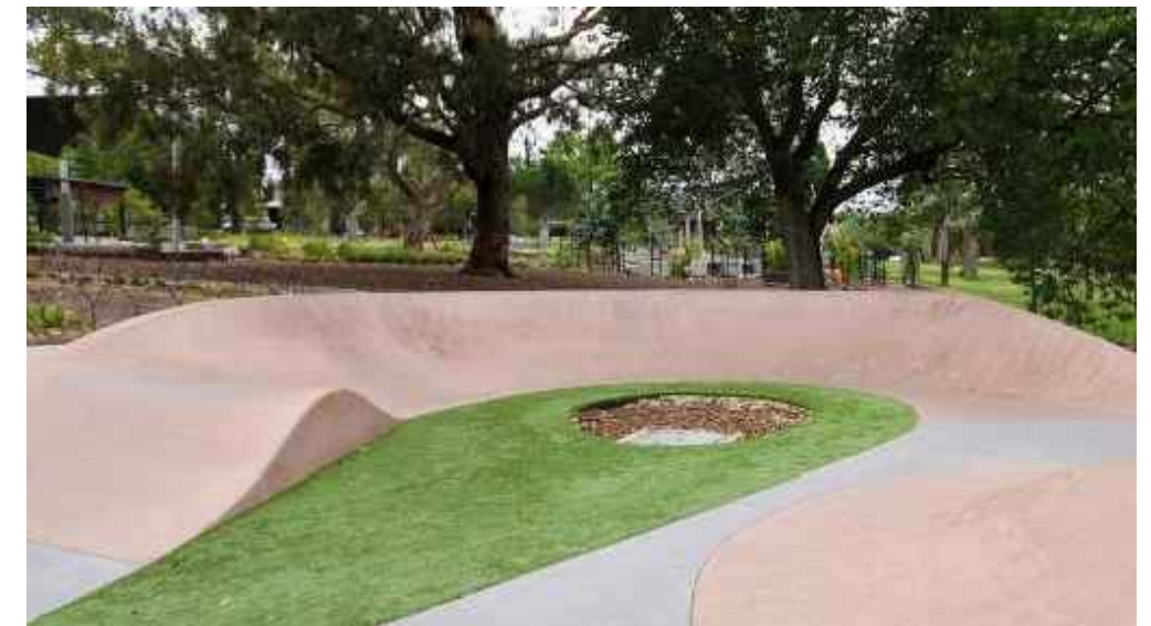
Scooter track with rollers and berm