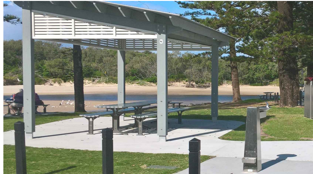
Picnic table and shelter with adequate circulation / Accessible drinking fountain