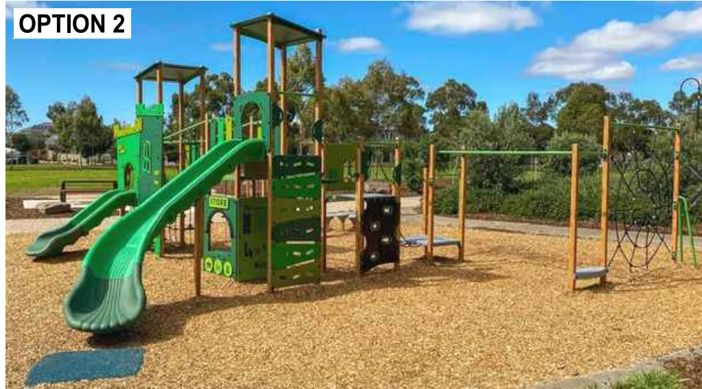
Play equipment (for 2-13year olds) with rubber softfall - OPTION 2