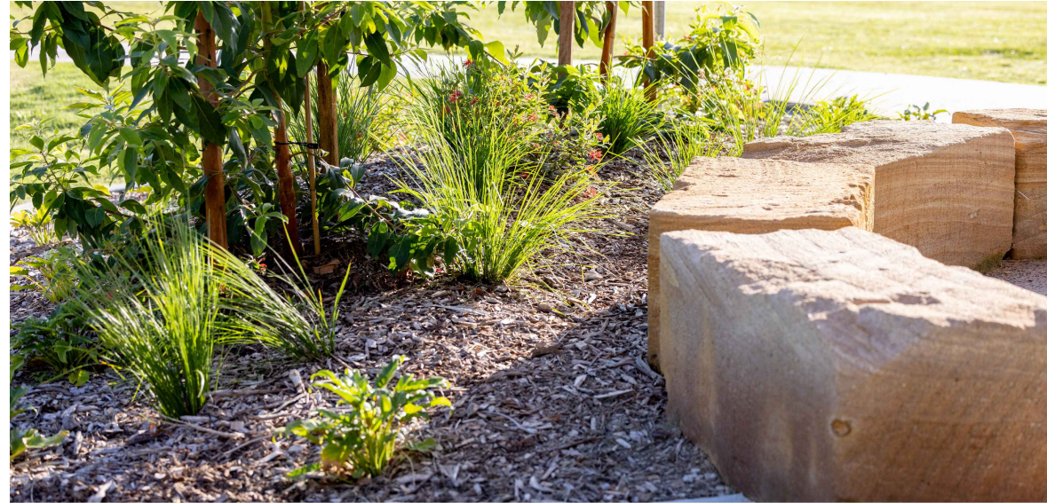
Sandstone retaining seat/walls