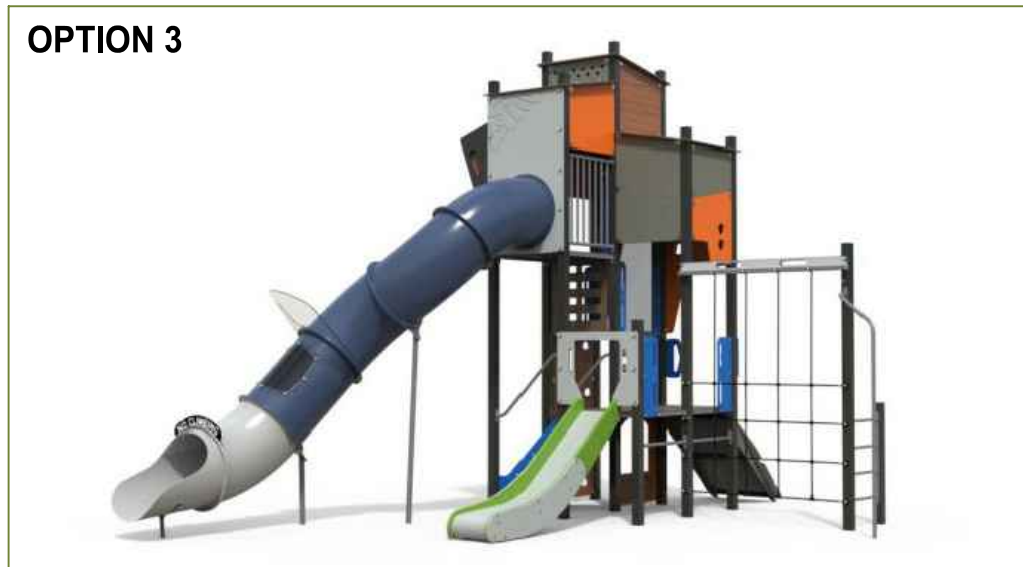
Play equipment (for 2-13year olds) with rubber softfall - OPTION 3