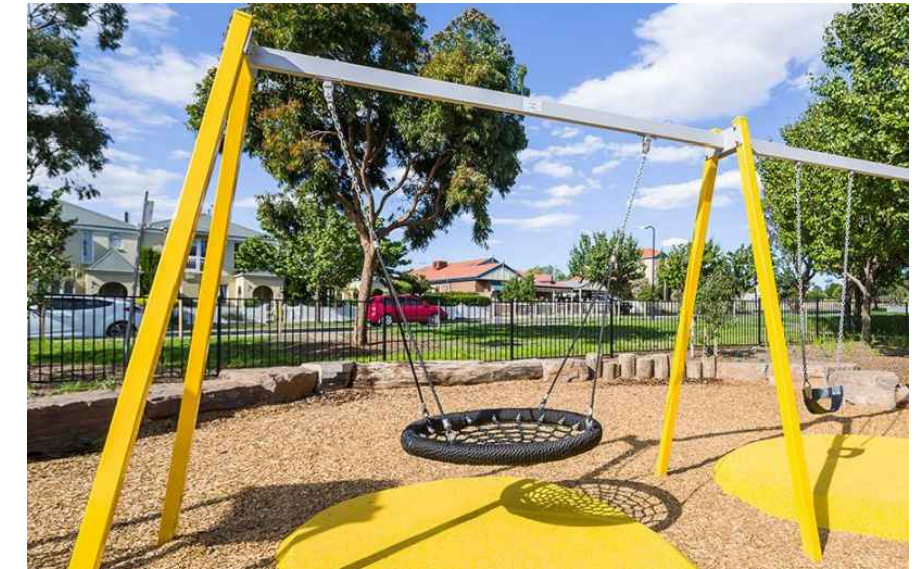
Swings nest/basket & strap seat with rubber soft fall