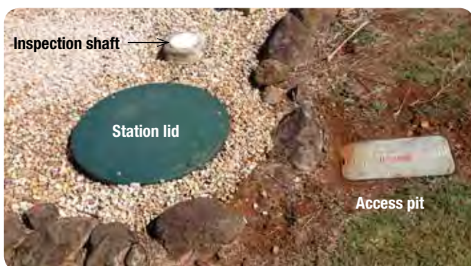
Only the inspection shaft and lids of the station and access pit are visible above ground. In many cases the access pit lid is purple or black.

Pump stations are situated below ground, with only the lid and inspection shaft showing. The station comprises a small holding tank and a pump, which is powered by the property's domestic power supply. The pump station has a control box, normally located near your electricity meter box. The control box has an alarm (to alert you to a problem) and a mute button (to silence the alarm).