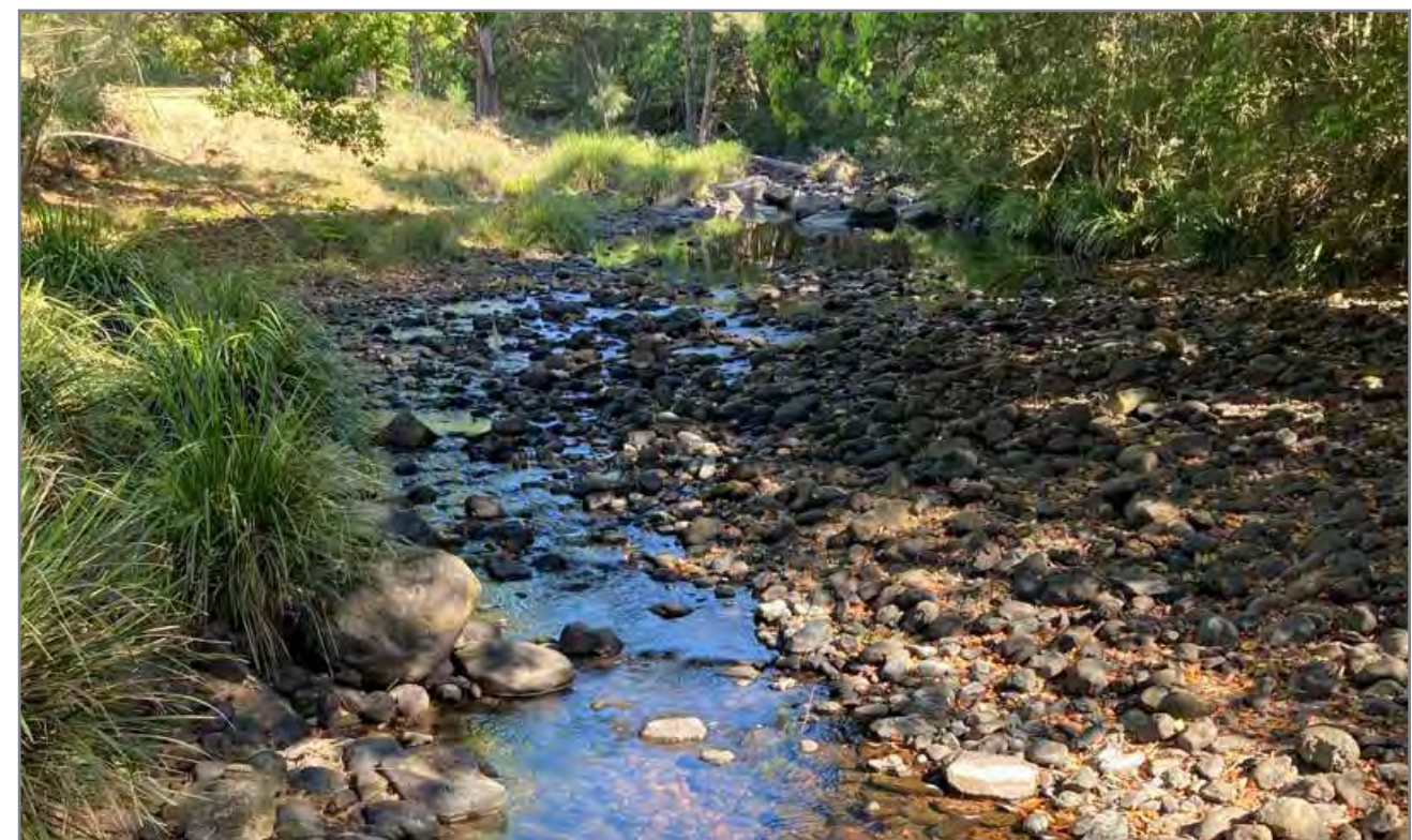
This is a river, not a creek – it's the Oxley River at Tyalgum and the flow has reduced to a trickle.

Tweed Shire Council wishes to acknowledge the Ngandowal and Minyungbal speaking people of the Bundjalung Country, in particular the Goodjinburra, Tul-gi-gin and Moorung - Moobah clans, as being the traditional owners and custodians of the land and waters within the Tweed Shire boundaries. Council also acknowledges and respects the Tweed Aboriginal community's right to speak for its Country and to care for its traditional Country in accordance with its lore, customs and traditions