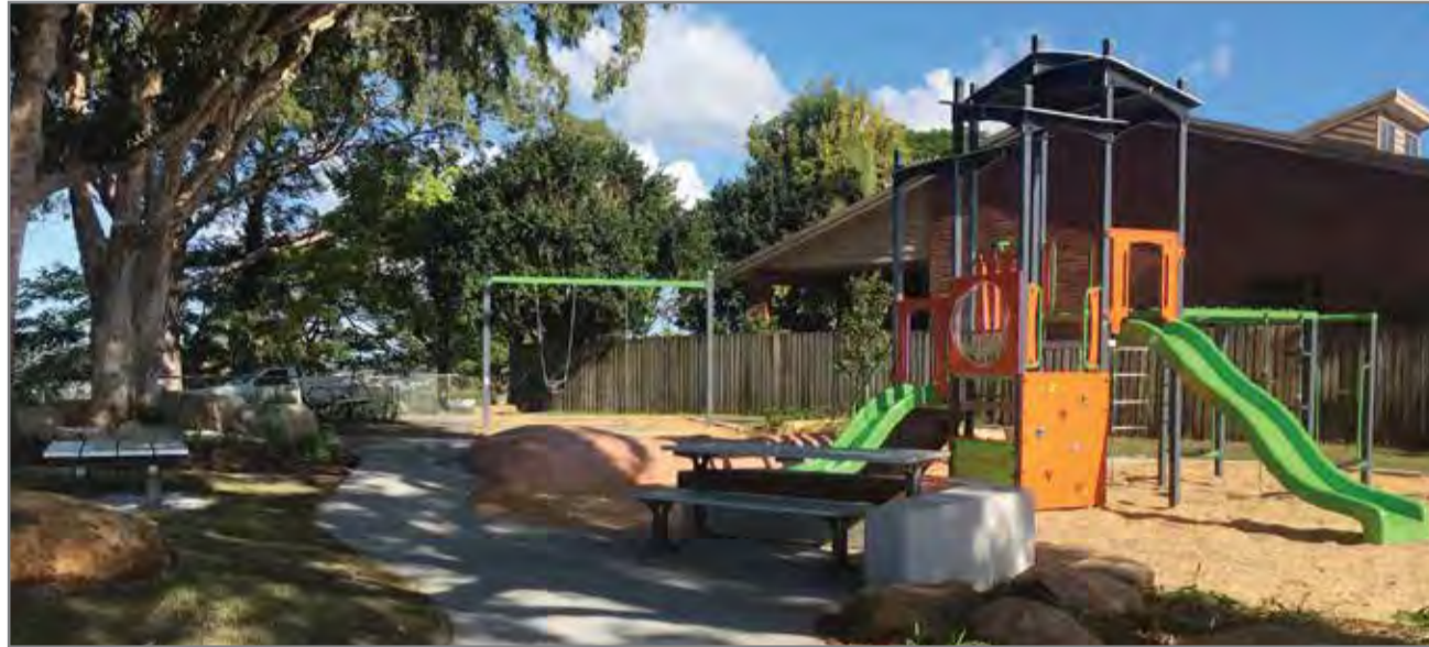
The new Coral Street Park at Bilambil Heights opened last week, much to the delight of local residents.