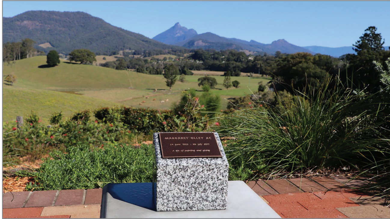
A memorial plaque indicates the location of Margaret Olley's final resting place in the grounds of the Tweed Regional Gallery and Margaret Olley Art Centre.

Tweed Shire Council wishes to recognise the generations of the local Aboriginal people of the Bundjalung Nation who have lived in and derived their physical and spiritual needs from the forests, rivers, lakes and streams of this beautiful valley over many thousands of years as the traditional owners and custodians of these lands.