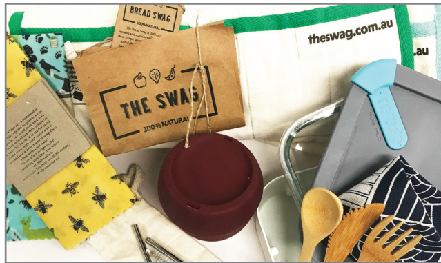
Some plastic-free ideas to inspire you in Plastic Free July.

Council is joining the solution to plastic pollution by participating in the Plastic Free July challenge.