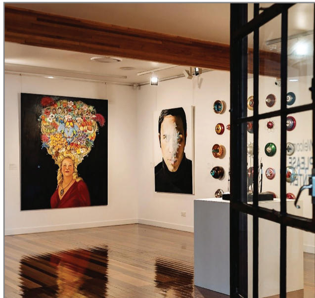
Director's Choice from the Tweed Regional Gallery collection installation view, Gallery DownTown, until 13 June 2021.

Initially launched as a 12-month pilot project in January 2019, Gallery DownTown was an initiative of Tweed Shire Council to act as a driver of creative and economic development in the heart of Murwillumbah.