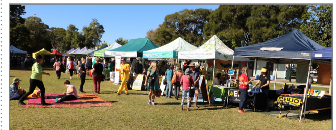
The World Environment Day Festival was blessed with clear skies and bright sunshine.

Visit tweed.nsw.gov.au/sustainabilityawards for more on the awards.