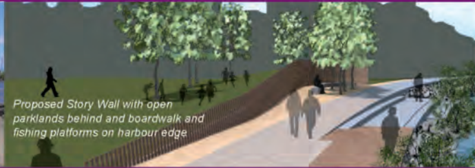
Proposed Story Wall with open parklands behind and boardwalk and fishing platforms on harbour edge