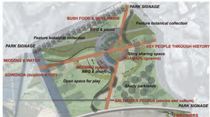
The 'Goorimahbah - Place of Stories' Concept Plan from the 2006 Public Consultation Display.

This theme reflects the significance of the coastline for the community. These places of culture and sustenance before European colonisation are tangible remnants in this site. The proposed '3 brothers' sculptures, by local artist Garth Lena, in the mangroves are intended to explore the story of the shaping of the coastline and focus vertical markers south towards the Fingal Lighthouse. The adjacent story wall, the structure of which will be constructed in stage 1, incorporates artwork and text describing the culture of the 'saltwater people', their ties to the land and more recent history.