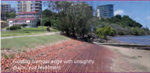
Existing harbour edge with unsightly drains and revetment