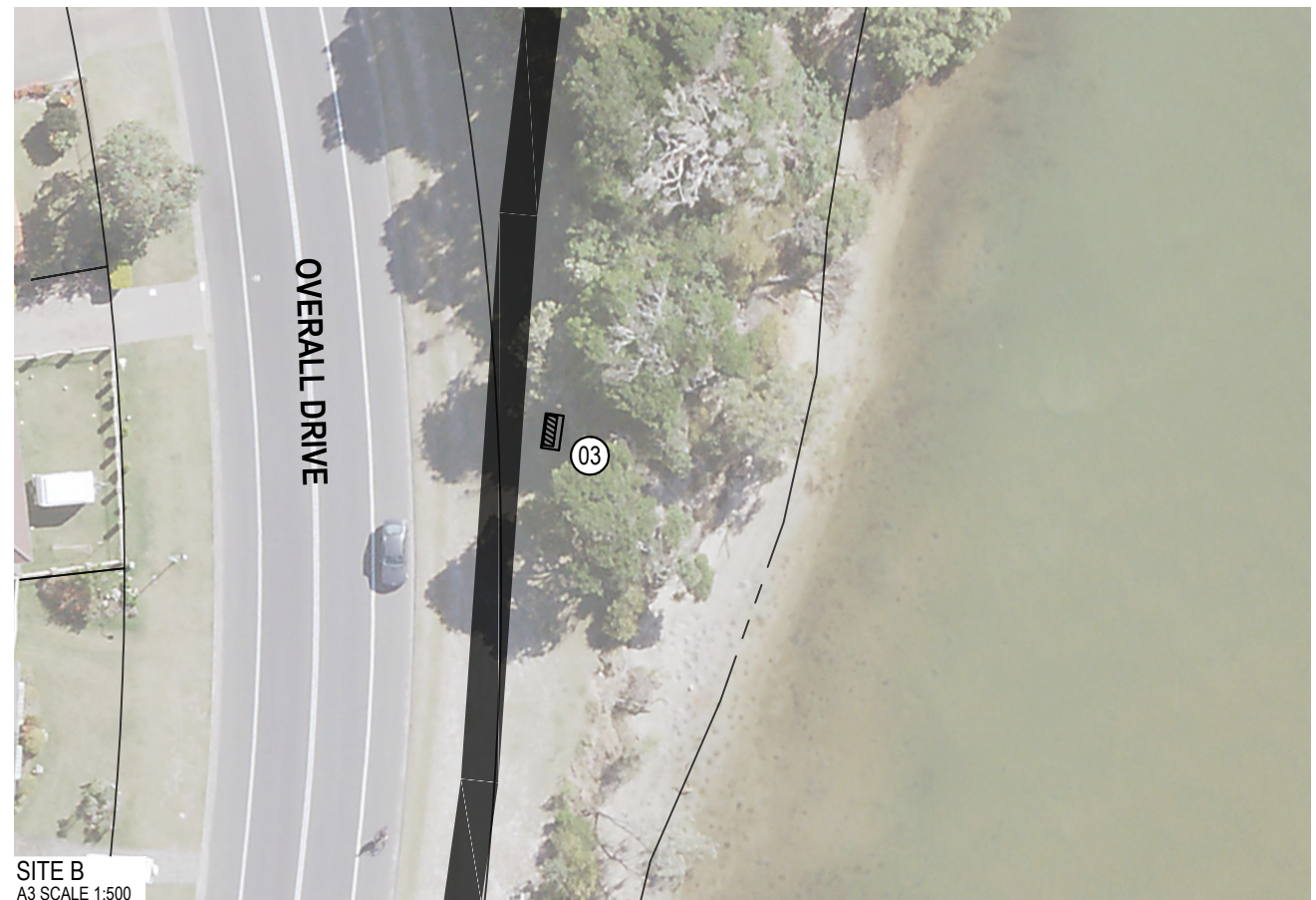
SITE B A3 SCALE 1:500