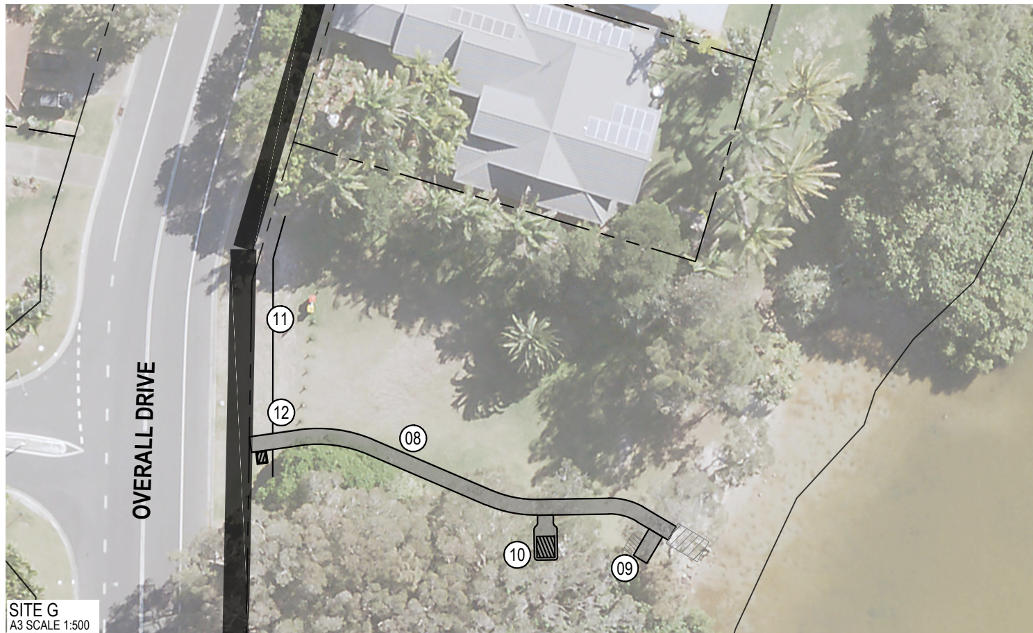
SITE G A3 SCALE 1:500