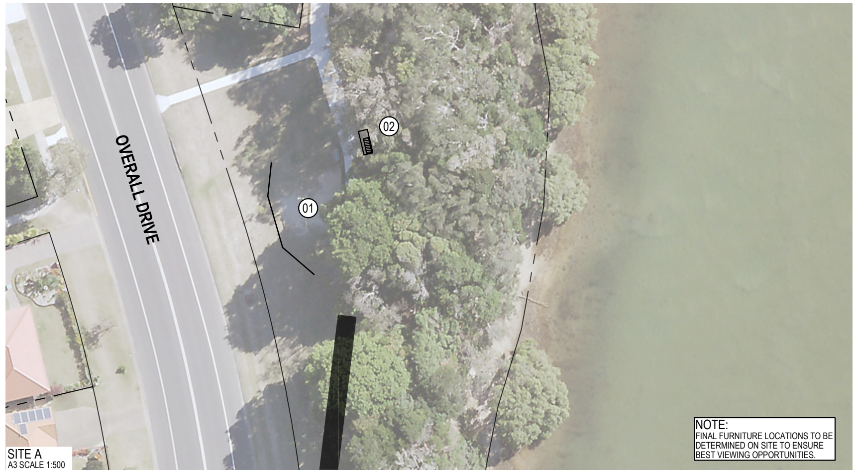
SITE A A3 SCALE 1:500

NOTE: FINAL FURNITURE LOCATIONS TO BE DETERMINED ON SITE TO ENSURE BEST VIEWING OPPORTUNITIES.