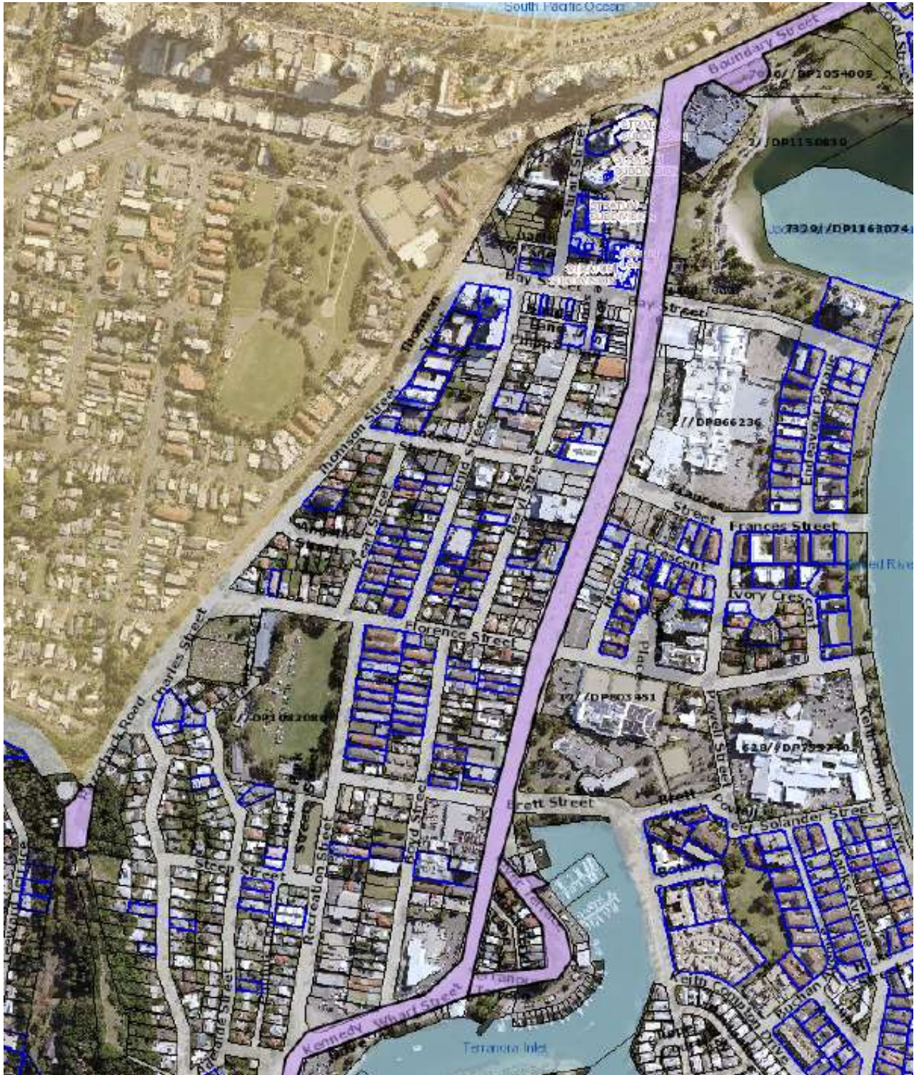
Figure 1 - Tweed Heads Alcohol-Free Zones (incl. proposed area)