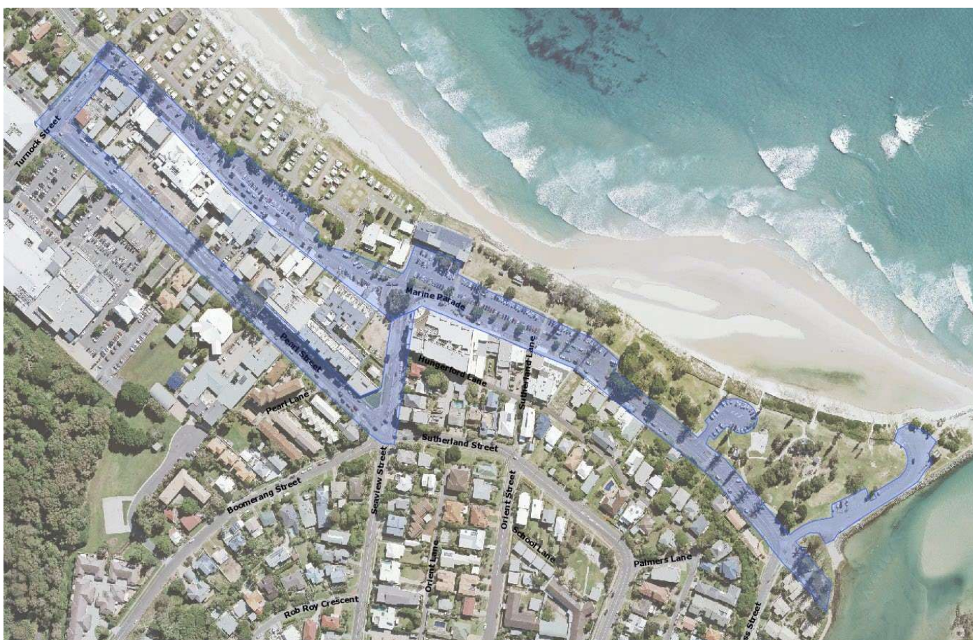
Figure 3 - Kingscliff Alcohol-Free Zones