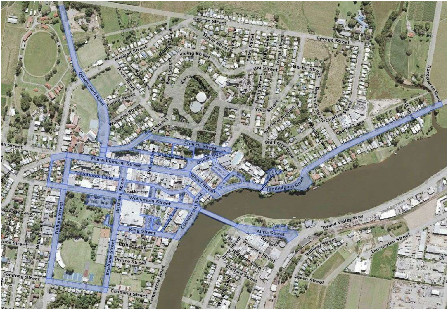
Figure 7 - Murwillumbah Alcohol-Free Zones