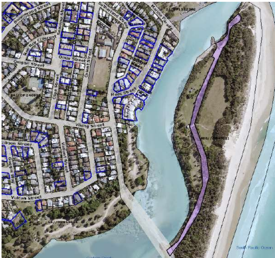
Figure 4 - Kingscliff (continued) Alcohol- Free Zones (incl. proposed area)