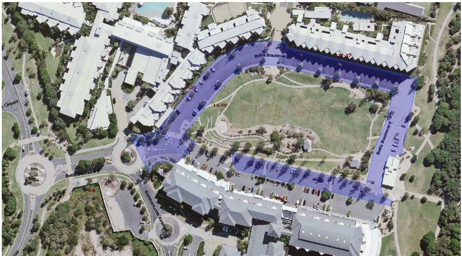
Figure 5 - Salt Alcohol-Free Zones