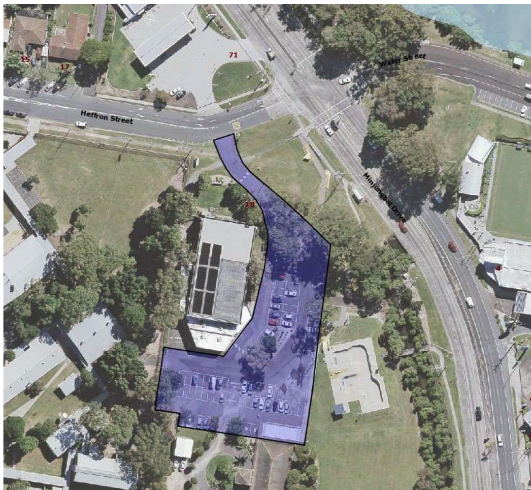
Figure 2 - Tweed Heads South Alcohol- Free Zones