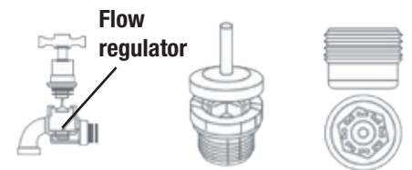
Tap cross section

Tap insert regulators are fitted within the body of the tap and reduce the flow rate of water passing through. Regulators can be fitted into taps serving a vanity basin or kitchen sink. In this case, a tap outlet regulator would not be required as the flow regulation occurs within the tap. They can be also fitted to the taps serving a shower, thereby reducing the flow rate of the shower. In this case water efficient shower heads are not required. Tap insert regulators are out of sight, and most users would not be aware that they are in place.