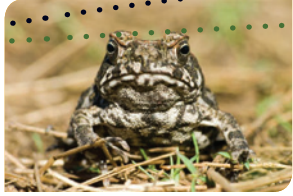
Appendix 3 Islands in Western Australia with no record of cane toads, but holding populations of those native species determined to be highly impacted (at the population scale) in the presence of cane toads (i.e. species listed in Table 3). Data collated in 2010.