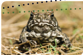
Appendix 2 Islands in the Northern Territory with no record of cane toads with no record of cane toads, but holding populations of those native species determined to be highly impacted (at the population scale) in the presence of cane toads (i.e. species listed in Table 3). Data collated in 2010.