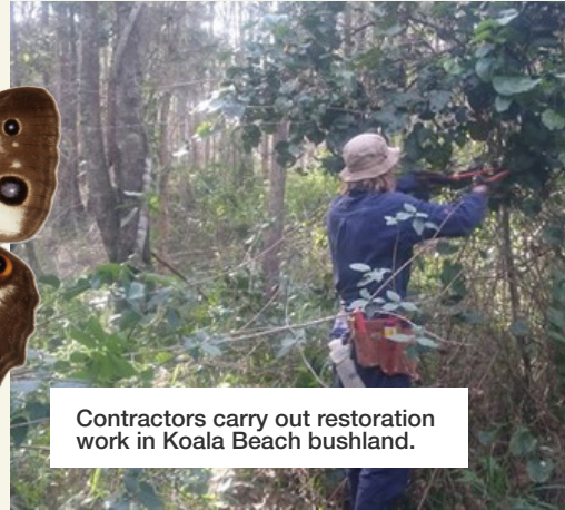
Contractors carry out restoration work in Koala Beach bushland.

Extensive and dense areas of swordgrass (actually a sedge) occur within the swamp forests surrounding Koala Beach estate, forming ideal breeding habitat for this conspicuous butterfly.