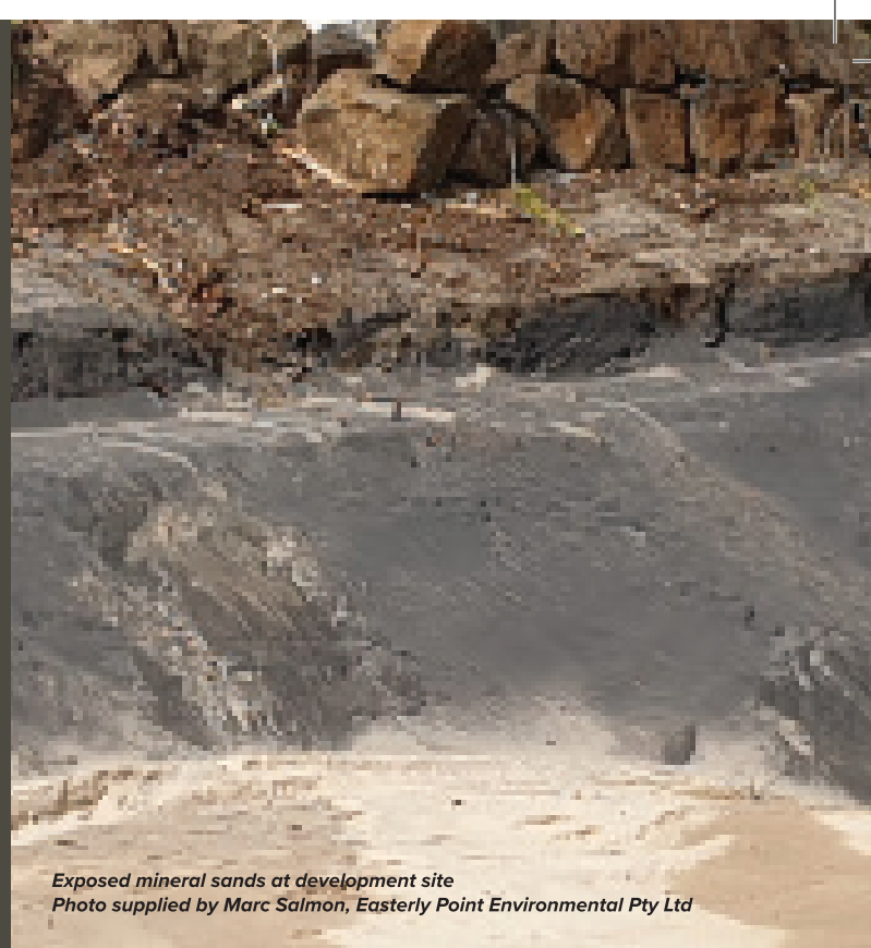
Exposed mineral sands at development site

Radiation meters cannot provide quantitative data from depth in pits, trenches or excavations, due to geometry effects. Subsurface samples should be collected and analysed at appropriately accredited laboratories. Derived dose rates can then be calculated from the activity concentrations of the isotopes.