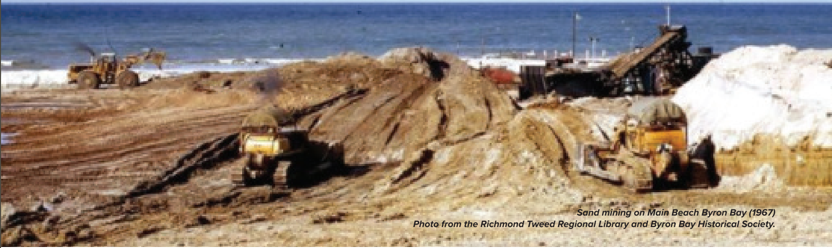
Sand mining on Main Beach Byron Bay (1967)