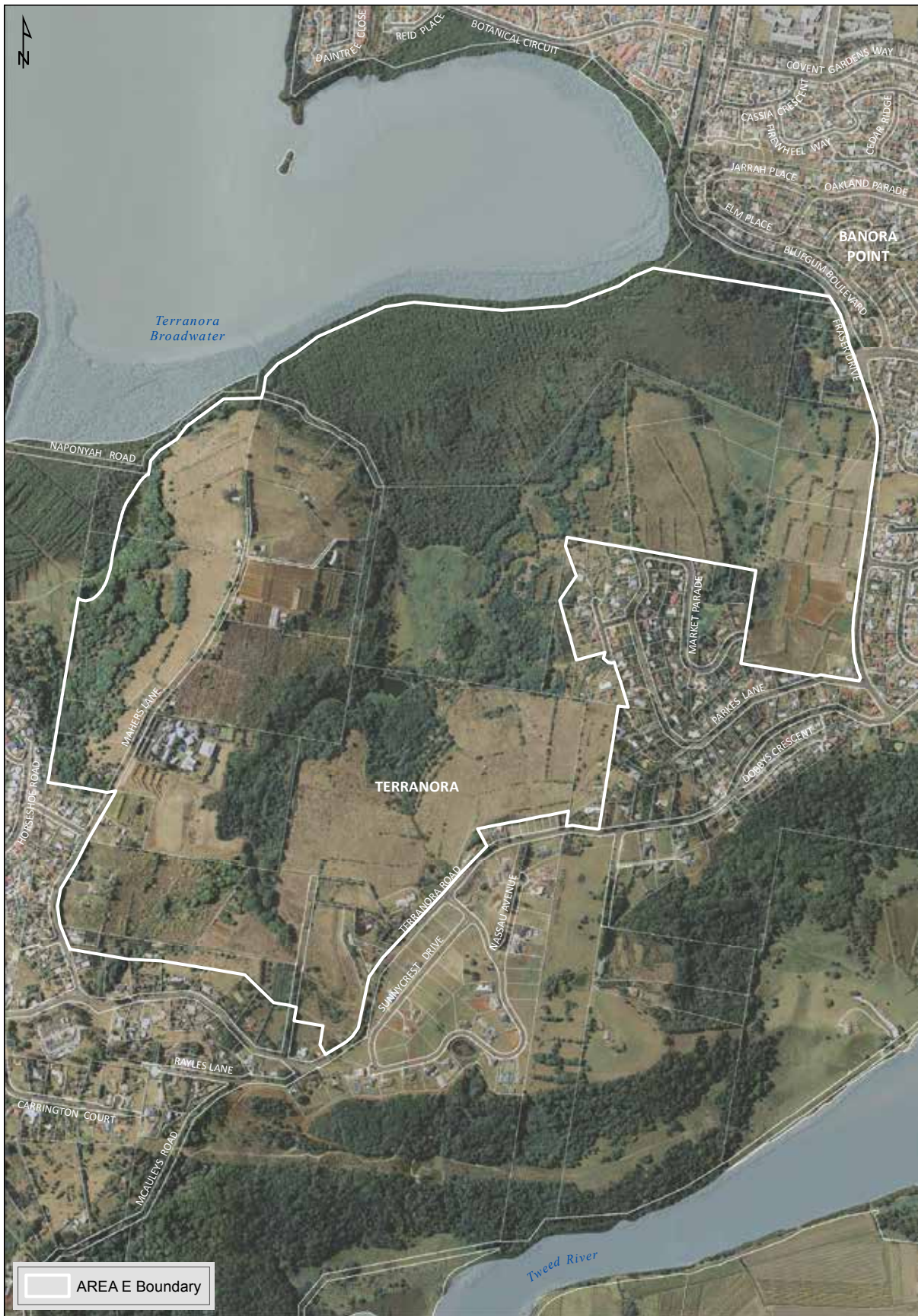
Figure 1.1 Area E Urban Release Area Code Boundary

This Code applies to all development on land situated within the boundary illustrated above.