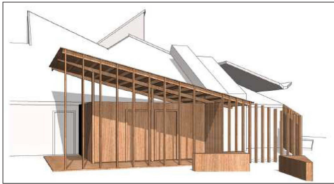
An artist impression of the new Budd Point toilet block.

For further information about the library upgrade and library services, visit www.tweed.nsw.gov.au/Library or the Richmond Tweed Regional Library website, www.rtrl.nsw.gov.au