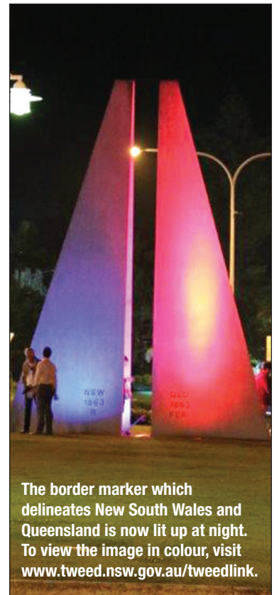
The border marker which delineates New South Wales and Queensland is now lit up at night. To view the image in colour, visit www.tweed.nsw.gov.au/tweedlink .

The border marker may be lit up in different colours for special events, such as green and gold for the Commonwealth Games, red, black and yellow for NAIDOC Week or pink for breast cancer awareness.