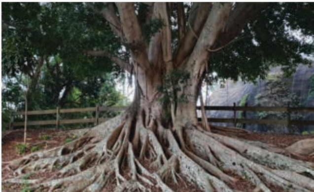
The Tweed's Favourite Tree, 2024 - "Dreaming Tree" located on Tumbulgum Road, overlooking the Tweed River.

View the photos and find out more about Council's Cool Towns Urban Forest Program at yoursaytweed.com.au/cool-towns