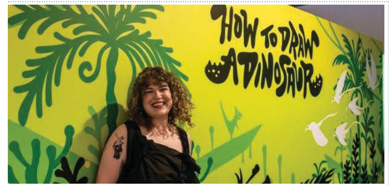
See the fascinating world of dinosaurs come to life by visiting How to Draw a Dinosaur at Tweed Regional Museum.

Issue 1378 | 11 December 2024 | ISSN 1327-8630