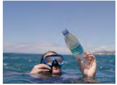
A screening of 'Rising Up' will be held at Tweed River High.

Registrations are essential. Book your ticket at events.humanitix.com/rising-up-movie-screening