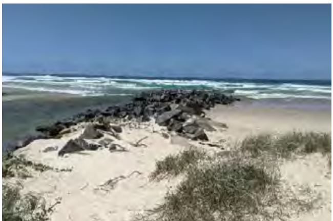
Work has commenced to restore Mooball Creek sea walls.

For more information on this proposed licence, visit yoursaytweed.com.au/proposed-licence-limpinwood