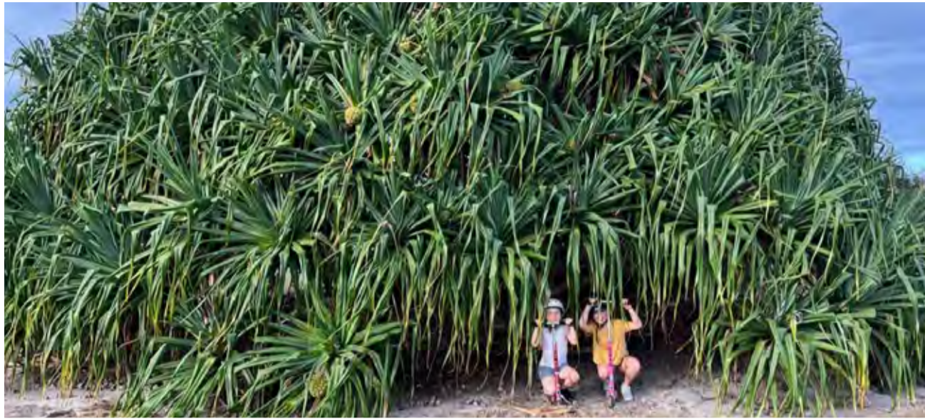
Tweed residents are invited to submit a photo of their favourite tree in the Tweed to promote the benefits of trees. Pictured here is last year's winner, this impressive pandanus tree at Kingscliff, submitted by Freddy and Essie.