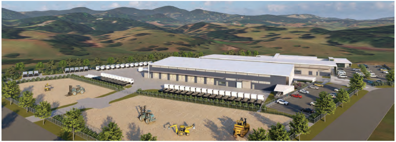
Artists impression of the new Council Works Depot, the subject of a Look Ahead workshop on the 23 October, designed to help businesses identify opportunities this project may bring.