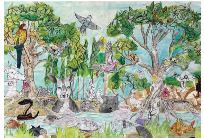
Artwork submitted by Murwillumbah High School students won an award in the Speaking 4 the Planet competition.

For full results of the 2024 Tweed Shire election, visit the NSW Electoral Commission website at elections.nsw.gov.au or call 1300 135 736.