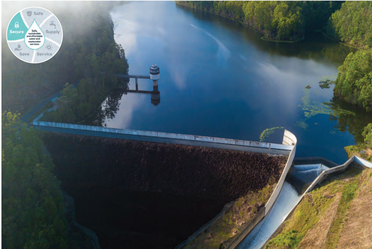
Tweed Shire Council's proposal to raise the existing Clarrie Hall Dam wall (pictured) by 8.5 metres would almost triple its capacity to about 42,300 megalitres, securing the Tweed's water supply until at least 2065.