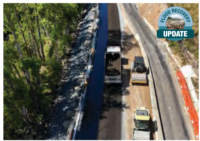
Road sealing underway on the eastbound lane at the slip site on Tyalgum Road.

For more information, visit tweed.nsw.gov.au/flood-restoration-works