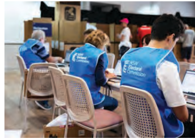
Counting is underway following Saturday's Local Government election, with final results expected in early October.

Councillors will also undertake an induction program designed to prepare them for their roles during the 4-year term, in line with guidelines from the Office of Local Government.