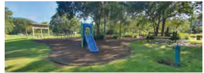
Attend a breakfast and have your say on Uki's Sweetnam Park.

Join us at the breakfast, view the plan and have your say at yoursaytweed.com.au/sweetnampark .