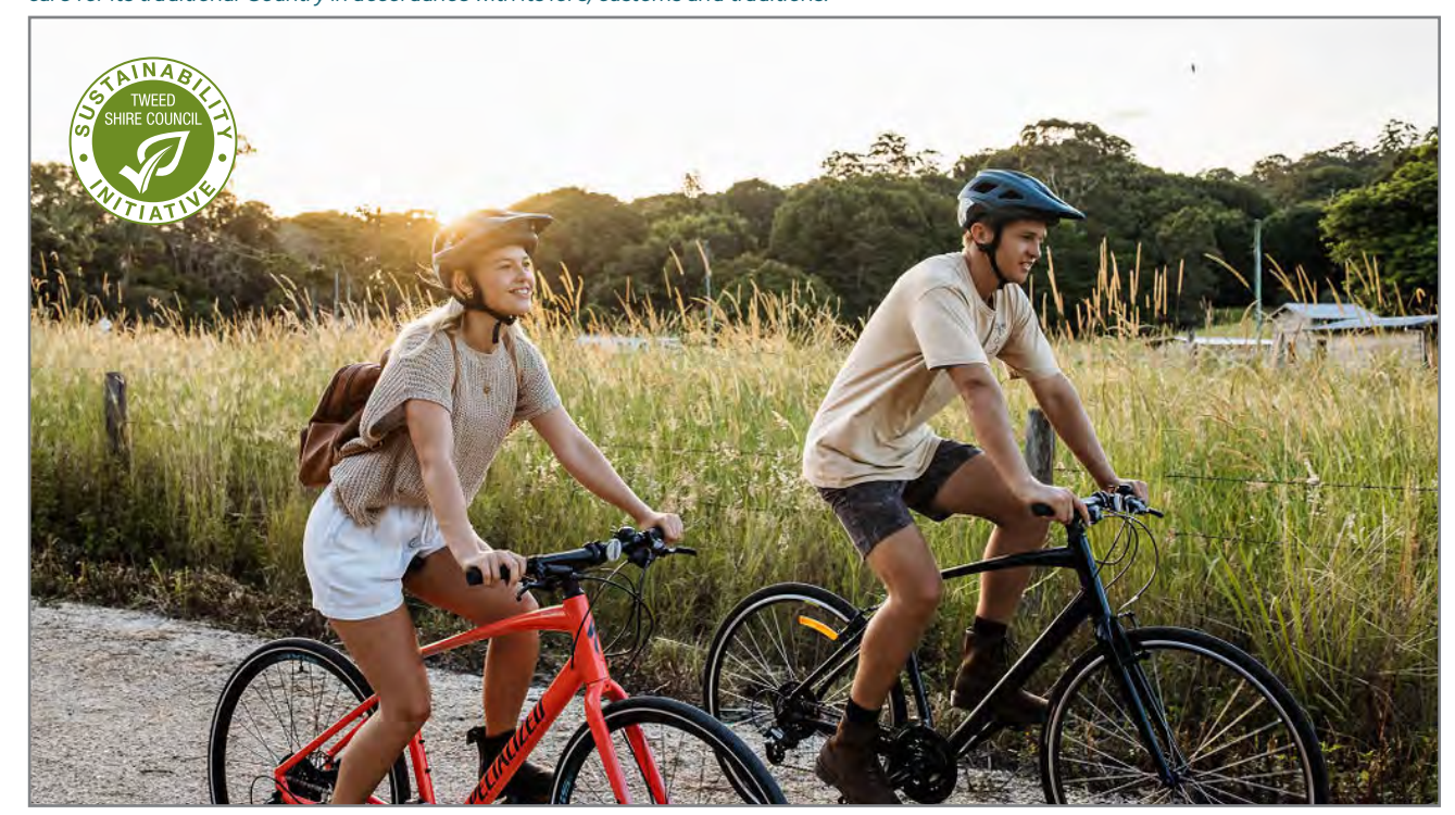
Residents are invited to the next Community Action Network event at Mooball to explore the topic of sustainable transport.

Tweed Shire Council wishes to acknowledge the Ngandowal and Minyungbal speaking people of the Bundjalung Country, in particular the Goodjinburra, Tul-gi-gin and Moorung - Moobah clans, as being the traditional owners and custodians of the land and waters within the Tweed Shire boundaries. Council also acknowledges and respects the Tweed Aboriginal community's right to speak for its Country and to care for its traditional Country in accordance with its lore, customs and traditions.