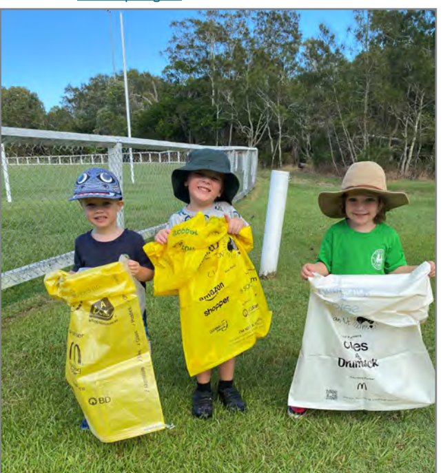
You can get involved on the day by organising your own clean up event or joining an existing event. These young residents helped out in Pottsville last year.

To register a clean up event, visit Clean Up Australia Day's website at cleanup.org.au