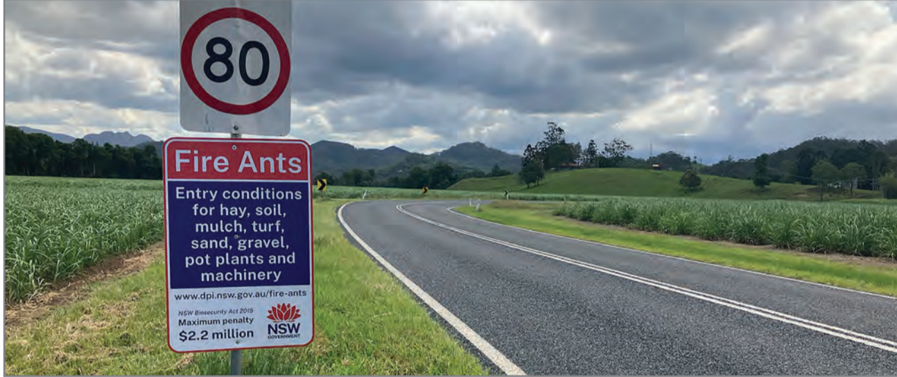
Signs have been erected at key entry and exit points across Murwillumbah, indicating entry to the declared 5 km biosecurity zone.

Tweed Shire Council wishes to acknowledge the Ngandowal and Minyungbal speaking people of the Bundjalung Country, in particular the Goodjinburra, Tul-gi-gin and Moorung – Moobah clans, as being the traditional owners and custodians of the land and waters within the Tweed Shire boundaries. Council also acknowledges and respects the Tweed Aboriginal community's right to speak for its Country and to care for its traditional Country in accordance with its lore, customs and traditions.