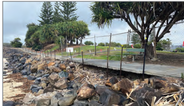
Council will soon start work on the repair, restoration and flood mitigation works at Ebenezer Park, Tweed Heads.

Read more at tweed.nsw.gov.au/latest-news