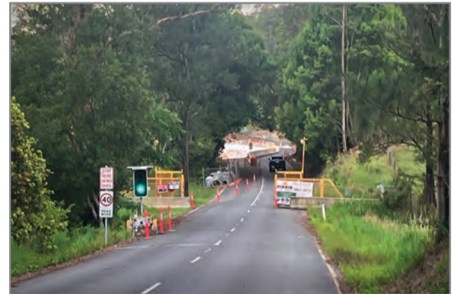
The Tyalgum temporary road access remains open to all vehicles under traffic lights.

For weekly updates on major flood restoration projects visit tweed.nsw.gov.au/flood-recovery-update