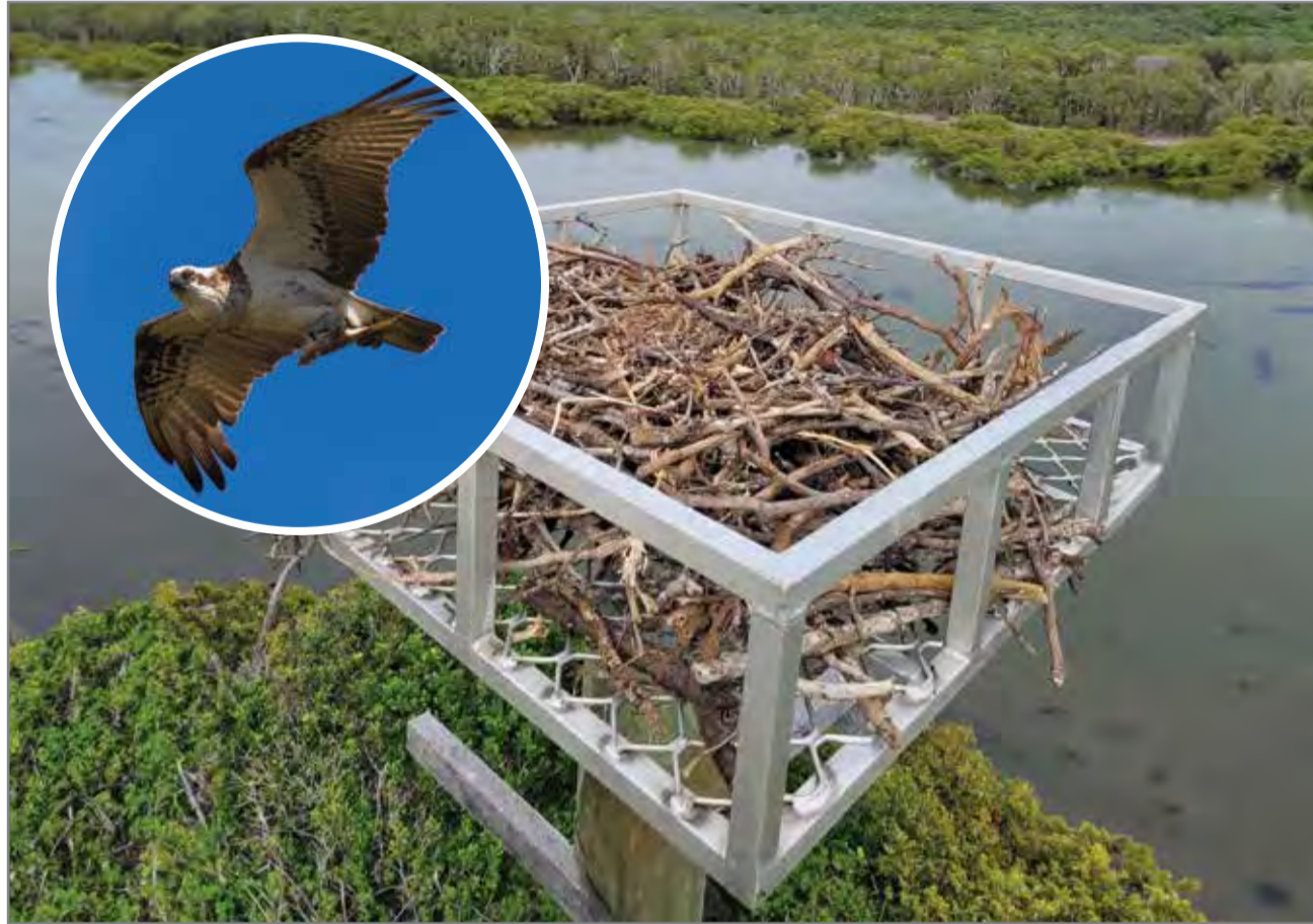
A new osprey nest cradle at Hastings Point. INSET: An osprey flying high in the Tweed after a successful fishing expedition. The species is listed as vulnerable to extinction in NSW.

Tweed Shire Council wishes to acknowledge the Ngandowal and Minyungbal speaking people of the Bundjalung Country, in particular the Goodjinburra, Tul-gi-gin and Moorung – Moobah clans, as being the traditional owners and custodians of the land and waters within the Tweed Shire boundaries. Council also acknowledges and respects the Tweed Aboriginal community's right to speak for its Country and to care for its traditional Country in accordance with its lore, customs and traditions.