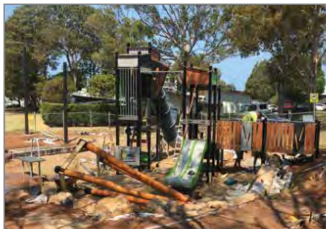
Work on the upgrade to the park and playground at Recreation Ground is getting closer to completion with much of the playground equipment now installed.

The swings and bouldering wall are now in place with a new public toilet to be installed next week.