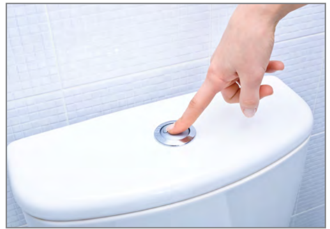
Sometimes, sewer blocks are Council's responsibility, so don't rush out and call a plumber.

Visit tweed.nsw.gov.au/reusable-nappy-rebate , for more information about the Residential Reusable Nappy Rebate Program and to apply for a rebate.