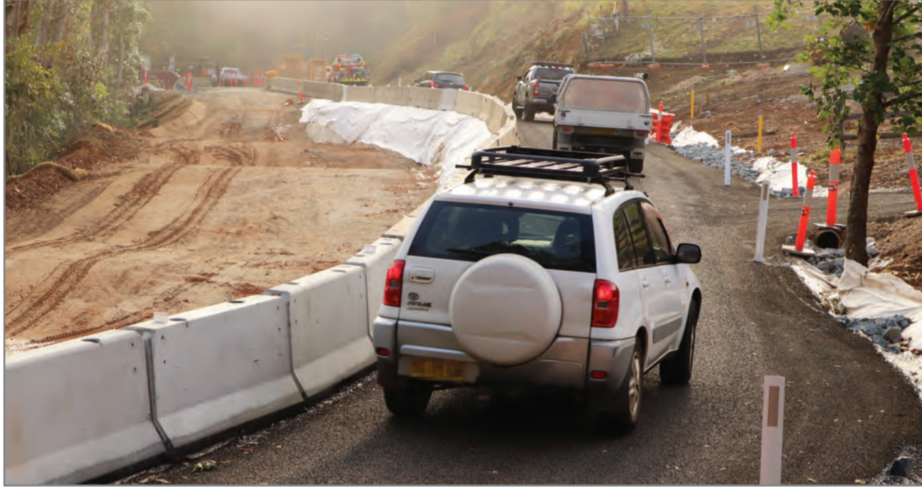
The Monday morning commute just got a whole lot quicker for Tyalgum residents, with the temporary access road open across the slip site.

Tweed Shire Council wishes to acknowledge the Ngandawal and Minyungbal speaking people of the Bundjalung Country, in particular the Goodjinburra, Tul-gi-gin and Moorung – Moobah clans, as being the traditional owners and custodians of the land and waters within the Tweed Shire boundaries. Council also acknowledges and respects the Tweed Aboriginal community's right to speak for its Country and to care for its traditional Country in accordance with its lore, customs and traditions.