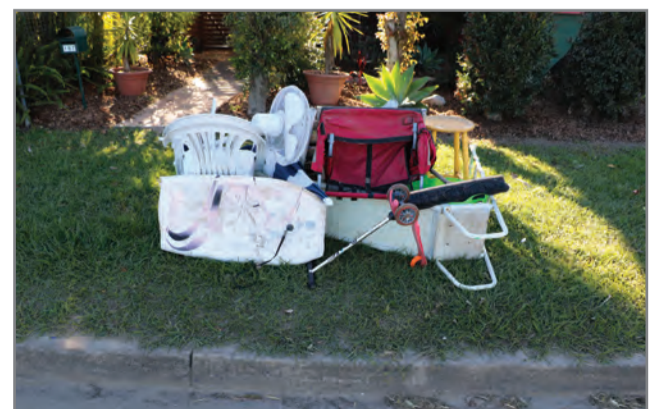
You can book a kerbside collection twice a (financial) year of up to 2 cubic metres each.

For more information on this service and to book online visit tweed.nsw.gov.au/on-call-kerbside-collection or call Council on 02 6670 2400.