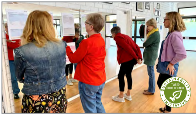
Residents are invited to a Community Action Network event at Kingscliff to explore reducing electricity use and taking steps on climate action.

Motorists are asked to keep to the 40 kmh speed limit when driving on the temporary access roadway and to be mindful of local wildlife, which got used to fewer vehicles in the area while the road was cut.