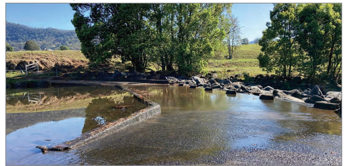
The Tyalgum Weir on the Oxley River is where Council sources water for Tyalgum. The river flow has reduced and the weir pool has dropped to the level that triggers Level 2 water restrictions for the village.

Tweed Shire Council wishes to acknowledge the Ngandowal and Minyungbal speaking people of the Bundjalung Country, in particular the Goodjinburra, Tul-gi-gin and Moorung - Moobah clans, as being the traditional owners and custodians of the land and waters within the Tweed Shire boundaries. Council also acknowledges and respects the Tweed Aboriginal community's right to speak for its Country and to care for its traditional Country in accordance with its lore, customs and traditions