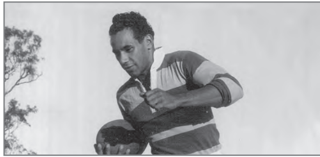
Lionel Morgan on the sports field.