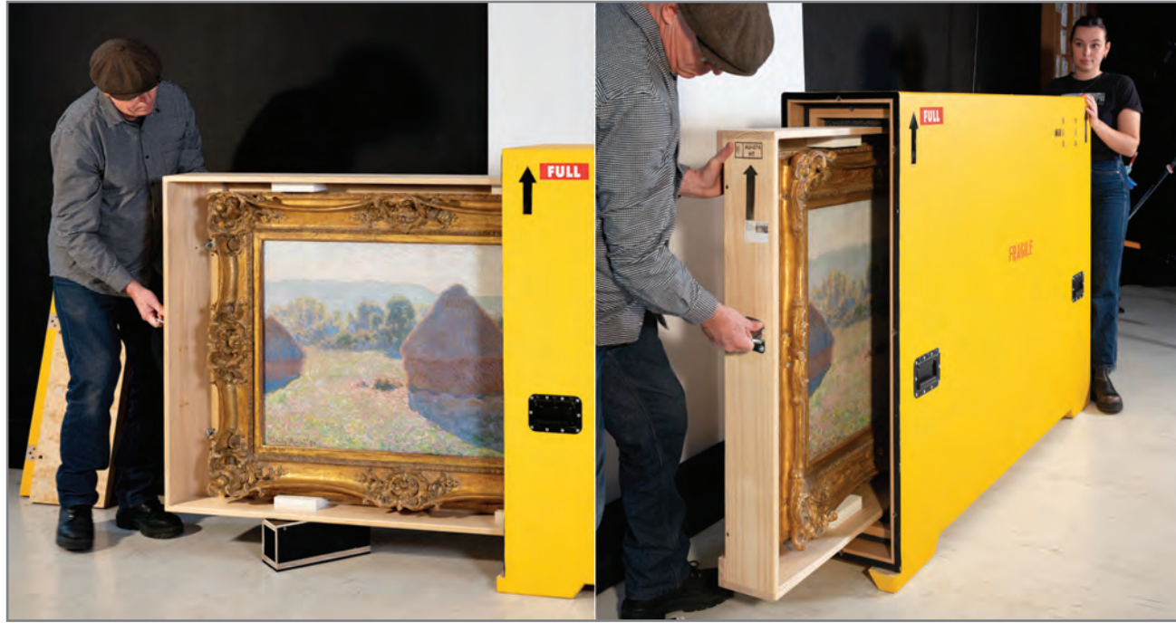
Behind the scenes at the National Gallery of Australia staff are preparing to share the work of art by renowned French impressionist Claude Monet, Meules, milieu du jour [Haystacks, midday] 1890, with the Tweed Regional Gallery.

Tweed Shire Council wishes to acknowledge the Ngandawal and Minyungbal speaking people of the Bundjalung Country, in particular the Goodjinburra, Tul-gi-gin and Moorung – Moobah clans, as being the traditional owners and custodians of the land and waters within the Tweed Shire boundaries. Council also acknowledges and respects the Tweed Aboriginal community's right to speak for its Country and to care for its traditional Country in accordance with its lore, customs and traditions.