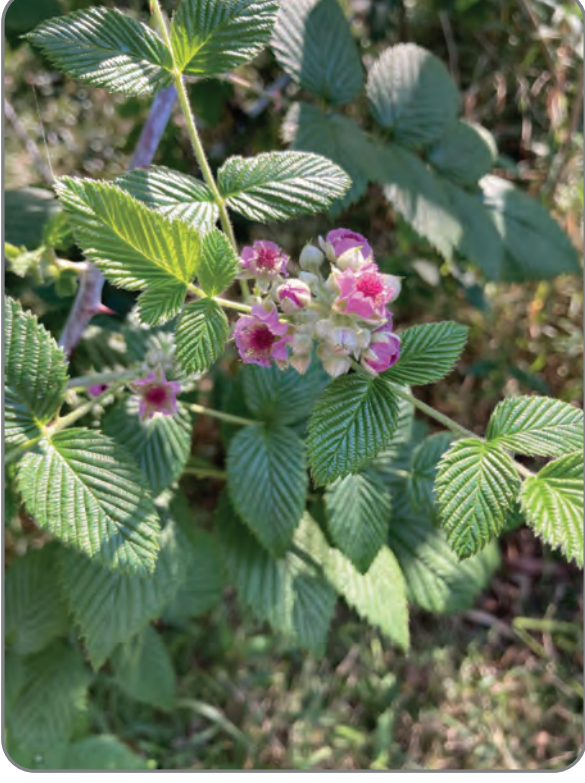
White blackberry (Rubus niveus) thrives during the cooler weather.

Now is the time that this weed is known to spread quickly, creating woody thickets that supress native vegetation – risking our precious environment in the Far North Coast region.