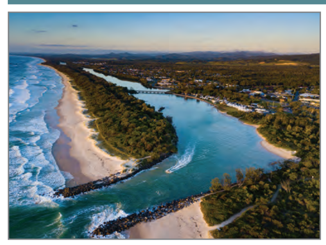
It's time to have your say on key open spaces at Pottsville.