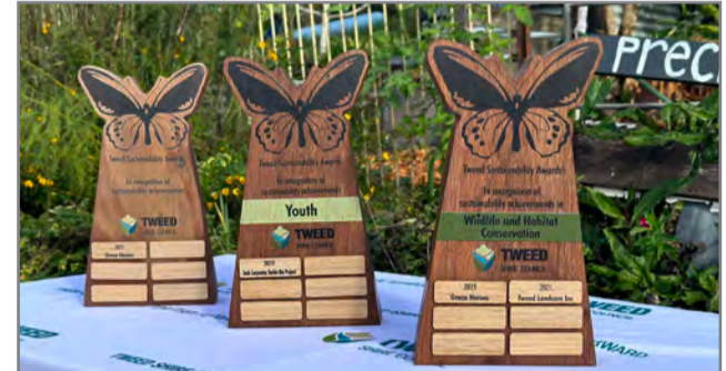
Nominations are now open with 4 categories in this year's Tweed Sustainability Awards.