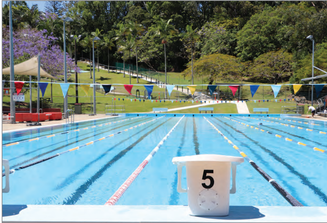
The 50-metre outdoor swimming pool at Council's Murwillumbah complex will be closed from 19 June until October 2023 to complete maintenance and flood restoration work. All of the centre's indoor facilities and programs will remain open.

Tweed Shire Council wishes to acknowledge the Ngandawal and Minyungbal speaking people of the Bundjalung Country, in particular the Goodjinburra, Tul-gi-gin and Moorung – Moobah clans, as being the traditional owners and custodians of the land and waters within the Tweed Shire boundaries. Council also acknowledges and respects the Tweed Aboriginal community's right to speak for its Country and to care for its traditional Country in accordance with its lore, customs and traditions.