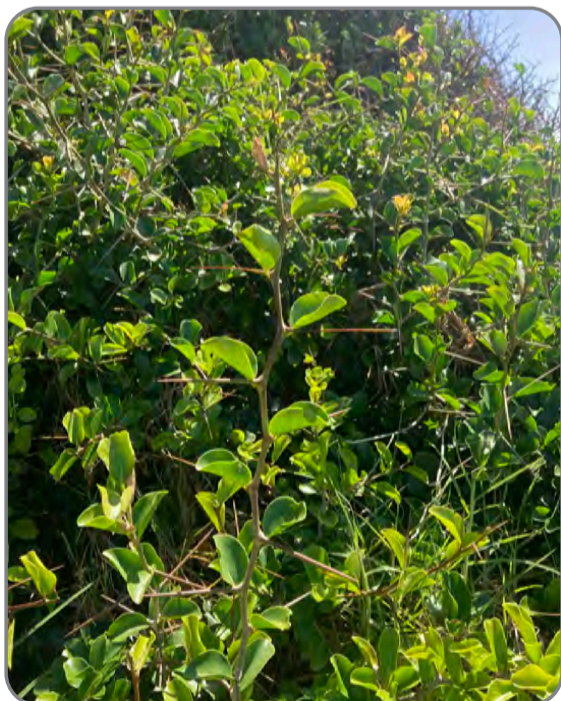
Kei apple grows up to 6 metres high with sharp thorns, has smooth green leaves and produces apricot-coloured fruit.

Originally from southern Africa, Kei apple is a drought and frost tolerant plant which can be found in Queensland and New South Wales. It grows in wooded grassland areas, bushland and along forest edges, and will tolerate most soil types.