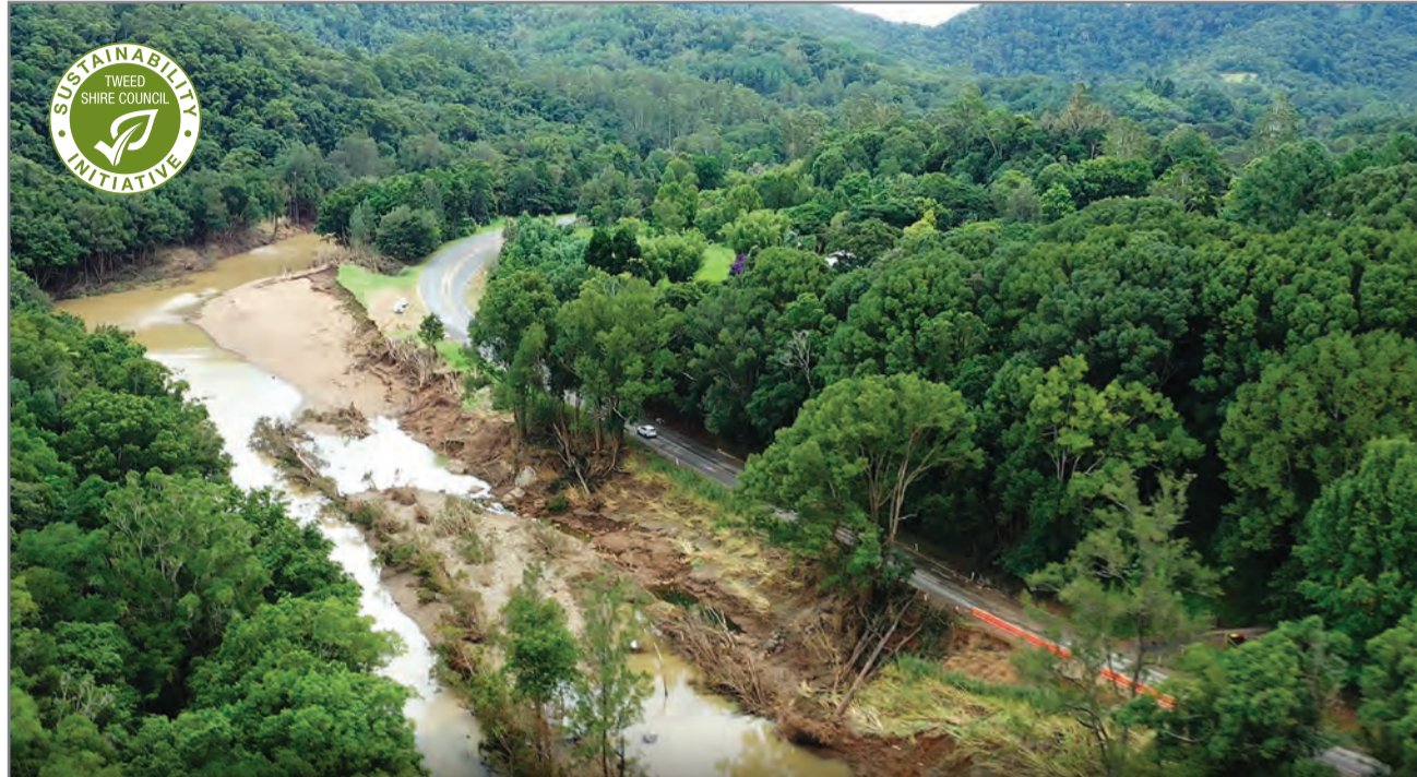
A section of the Tweed River at Uki that was severely damaged in the 2022 floods.

Tweed Shire Council wishes to acknowledge the Ngandawal and Minyungbal speaking people of the Bundjalung Country, in particular the Goodjinburra, Tul-gi-gin and Moorung – Moobah clans, as being the traditional owners and custodians of the land and waters within the Tweed Shire boundaries. Council also acknowledges and respects the Tweed Aboriginal community's right to speak for its Country and to care for its traditional Country in accordance with its lore, customs and traditions.