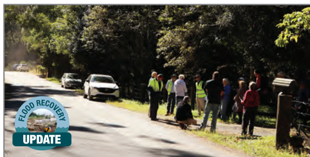
Byrrill Creek residents discuss restoration works on Byrrill Creek bridge at Terragon with members of Council's Flood Restoration team.