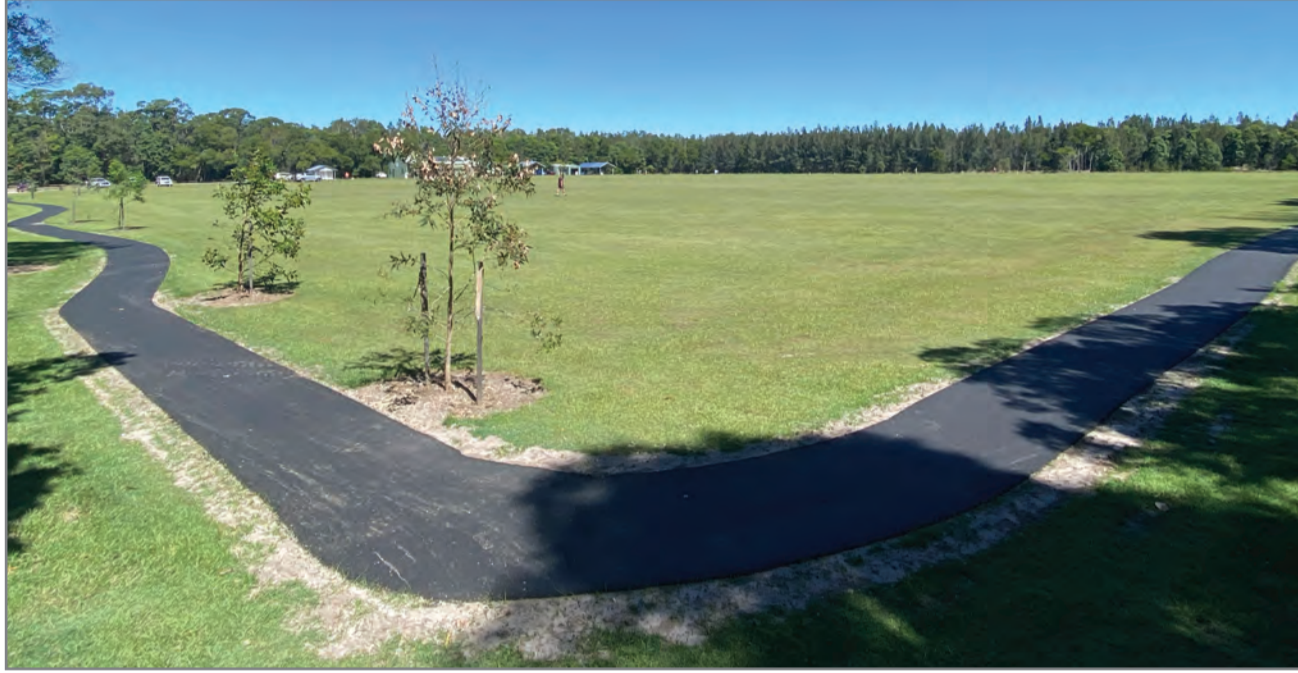
The new pathway at Black Rocks Sports Field at Pottsville has been completed.

Tweed Shire Council wishes to acknowledge the Ngandawal and Minyungbal speaking people of the Bundjalung country in particular the Goodjinburra, Tul-gi-gin and Moorung - Moobah clans as being the traditional owners and custodians of the land and waters within the Tweed Shire boundaries. Council also acknowledges and respects the Tweed Aboriginal community's right to speak for its Country and to care for its traditional Country in accordance with its laws, customs and traditions.