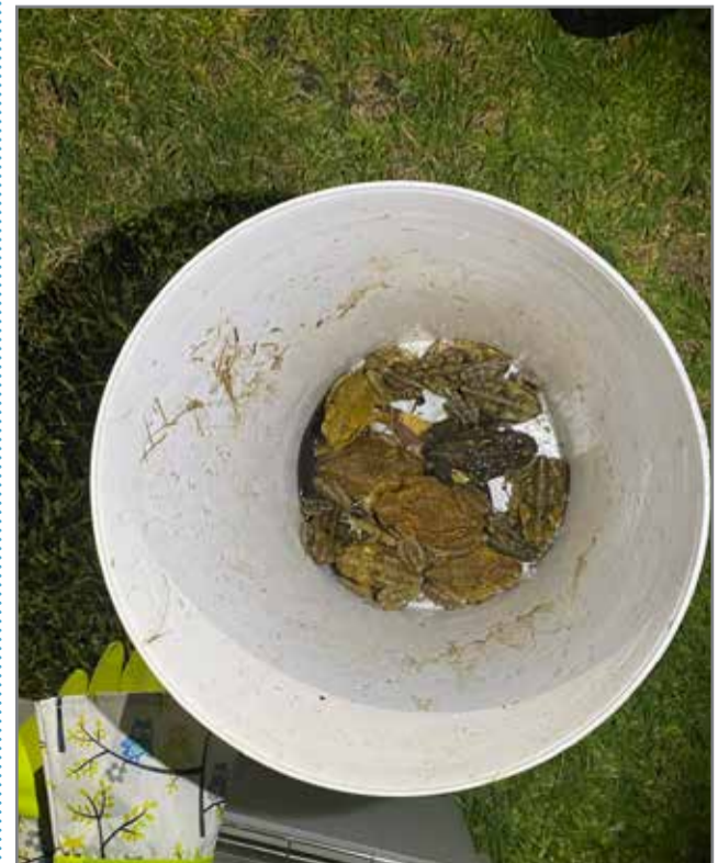
Great catch! One of the participants from the latest Tweed cane toad challenge with their haul.

Register for the free event or find out how you can tackle the cane toad problem at tweed.nsw.gov.au/cane-toads