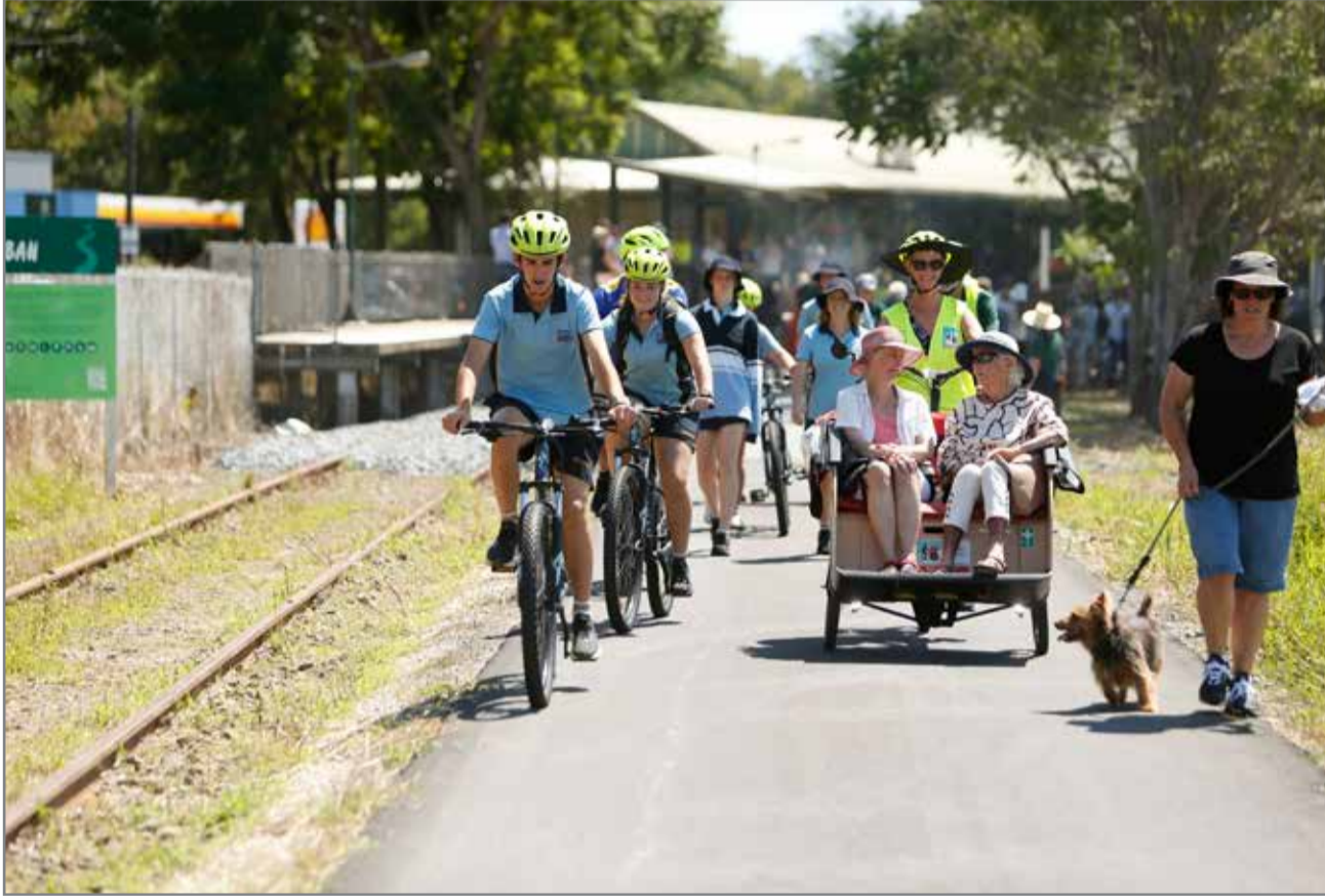
The Tweed leg of the Northern Rivers Rail Trail was officially opened last Wednesday, with much excitement from local walkers, runners, cyclists, school students and trishaw bike enthusiasts.

Tweed Shire Council wishes to recognise the generations of the local Aboriginal people of the Tweed Bundjalung Nation who have lived in and derived their physical and spiritual needs from the forests, rivers, lakes and streams of this beautiful valley over many thousands of years as the traditional custodians of these lands.