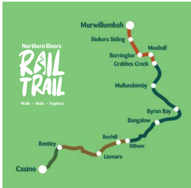
A community celebration to mark the opening of the Rail Trail is planned for the weekend of Saturday 25 and Sunday 26 March, with a host of fun, family-friendly activities on offer.

The opening follows the launch of the new Northern Rivers Rail Trail website, which provides comprehensive information allowing users to plan ahead of their visit.