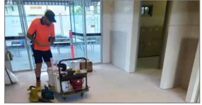
Flood resilience is being built into the Murwillumbah Community Centre.

To keep up to date with flood recovery work, including roadworks and major slips, visit tweed.nsw.gov.au/flood-recovery-update .