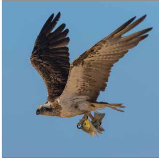
The local osprey pair from Hastings Point will have their nest relocated this week to a safer site nearby.

Find out how Council looks after the Tweed's coast and waterways, including 12 osprey nests at tweed.nsw.gov.au/coast-waterways