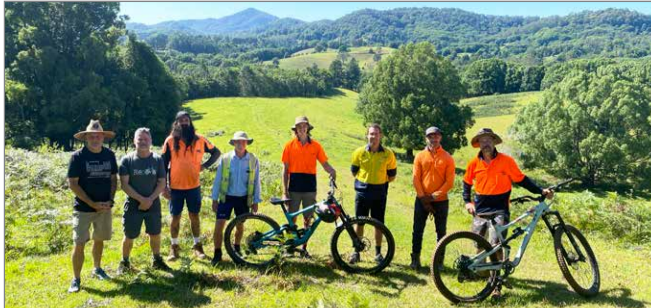
Council staff with members of the Tweed Valley Mountain Bike Riders Club and outdoor trail design and construction specialists Trailworx at the location of the new mountain bike track.

Tweed Shire Council wishes to recognise the generations of the local Aboriginal people of the Tweed Bundjalung Nation who have lived in and derived their physical and spiritual needs from the forests, rivers, lakes and streams of this beautiful valley over many thousands of years as the traditional custodians of these lands.