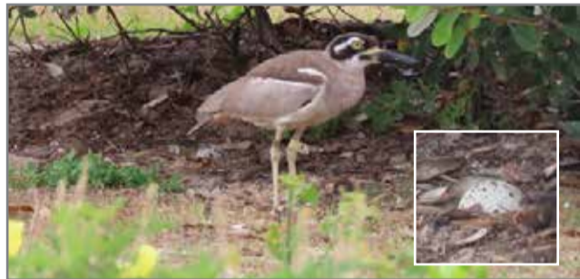
One of the nervous Beach Stone-curlew parents at Hastings Point recently. INSET: The Beach Stone-curlew egg laid on 4 December 2022.

Read the full story at tweed.nsw.gov.au/latest-news