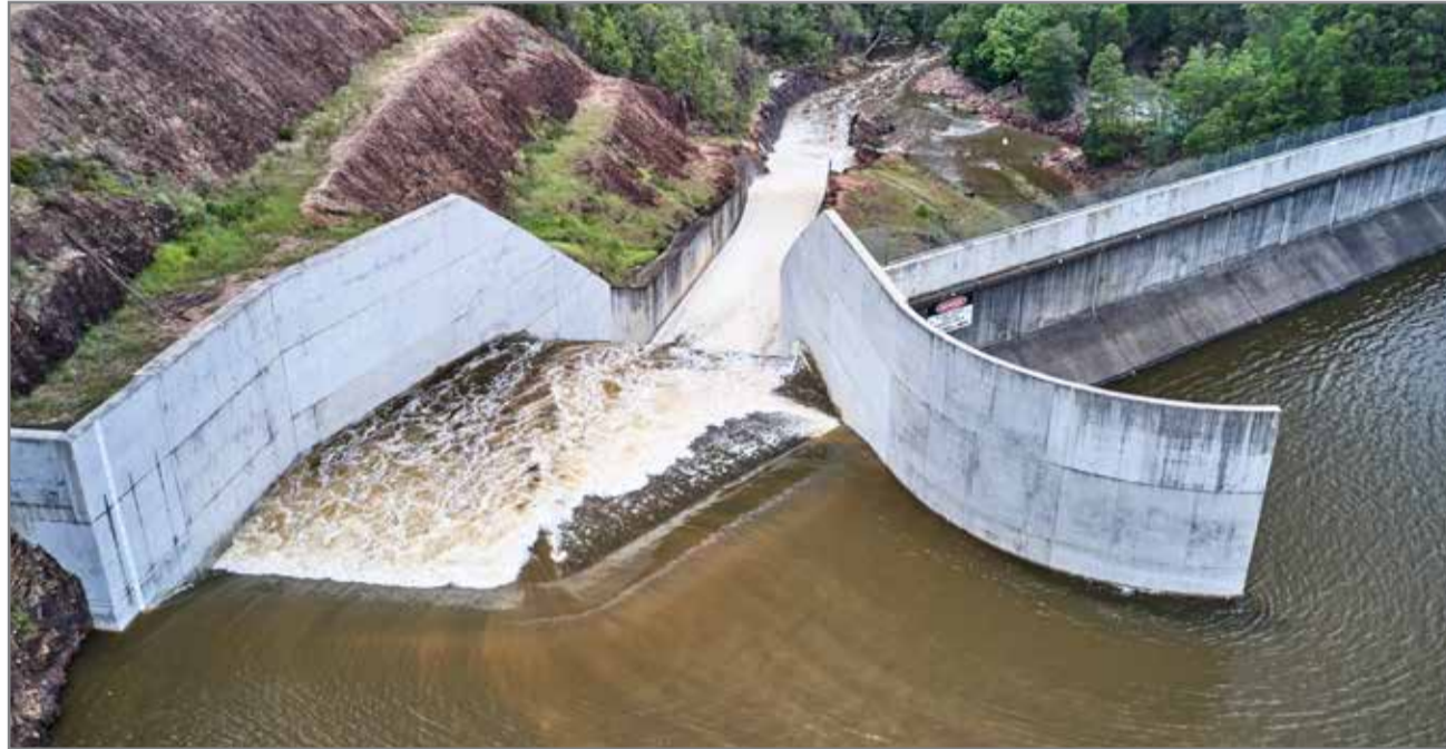
As the Clarrie Hall Dam fills during intense rainfall events, it is designed to safely pass the excess water into Doon Doon Creek and then the Tweed River. This spilling cannot be controlled.

Tweed Shire Council wishes to recognise the generations of the local Aboriginal people of the Tweed Bundjalung Nation who have lived in and derived their physical and spiritual needs from the forests, rivers, lakes and streams of this beautiful valley over many thousands of years as the traditional custodians of these lands.