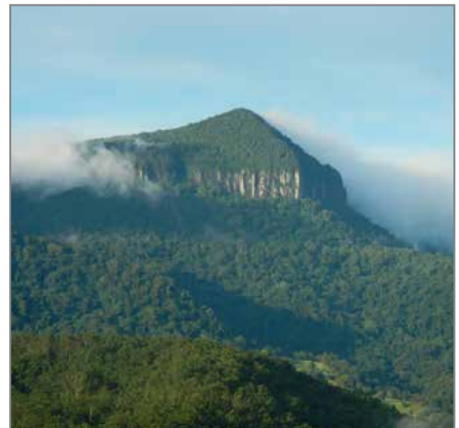
Helping to conserve the Tweed's ancient Gondwana rainforest in the Numinbah Nature Reserve is a critical element of Council's fight against climate change.