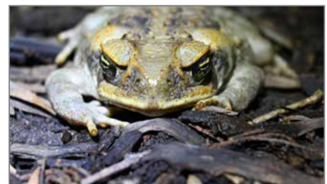
Join in the Cane Toad Challenge next month.

For more information contact canetoads@watergum.org