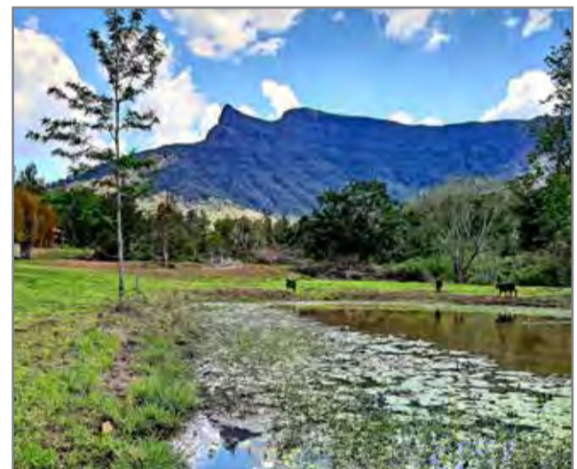
The field day for Tweed farmers will be hosted at a property at Pumpenbil, part of a larger project to build drought-resilient beef and dairy farms in the Tweed.

Registrations are essential and places are limited. To find out more or register, visit tweed.nsw.gov.au/agriculture-farming