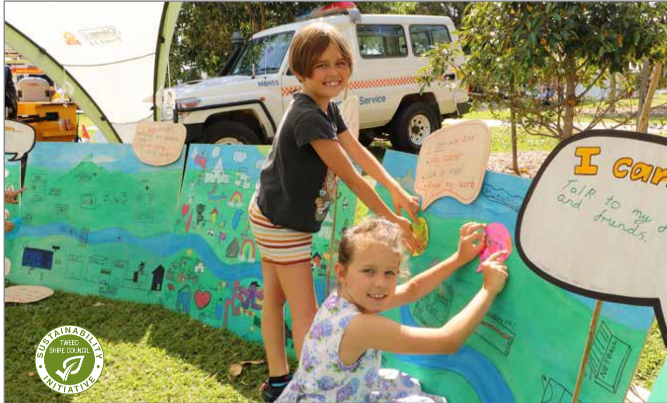
Many local kids got involved with an interactive mural installation during the Tweed Eco Festival adding their own ideas for creating an even more climate-resilient community.

Tweed Shire Council wishes to recognise the generations of the local Aboriginal people of the Bundjalung Nation who have lived in and derived their physical and spiritual needs from the forests, rivers, lakes and streams of this beautiful valley over many thousands of years as the traditional custodians of these lands.