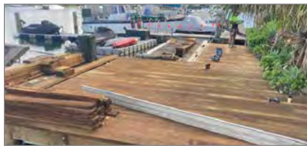
Substructure and new deck on the first landing section of the Jetties Boardwalk.

Further information about the project is on the Your Say Tweed project page at yoursaytweed.com.au/anchorage-islands