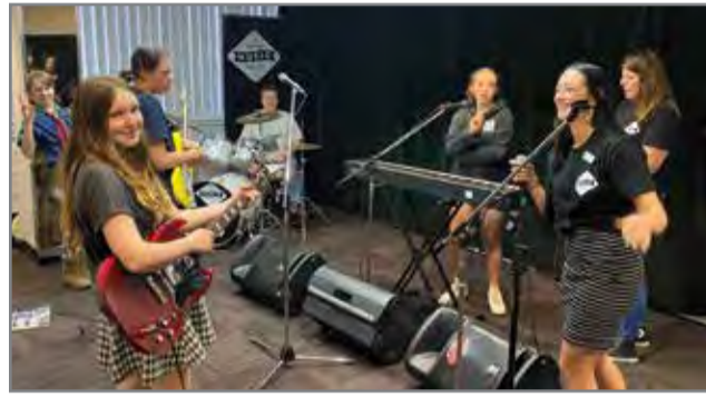
Bandmembers rehearsing for the Youth Music Venture Showcase Concert at Seagulls on Sunday 11 September.

Council, along with Seagulls have been huge supporters of the