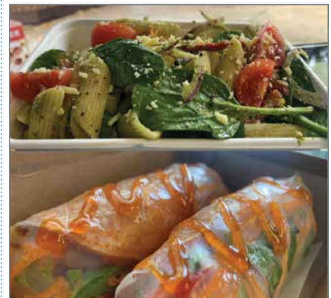
Yummy pasta salad and fresh veggie or chicken rice paper rolls are just some of the items on the menu at the Starting Block Café.

Check the full menu at trac.tweed.nsw.gov.au/starting-block-cafe