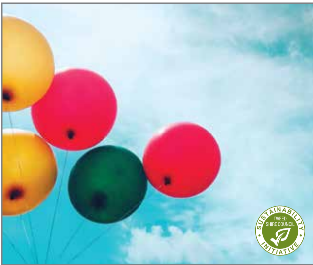
The release of helium balloons at Council-licensed events on public land and at Council-owned facilities has been banned.