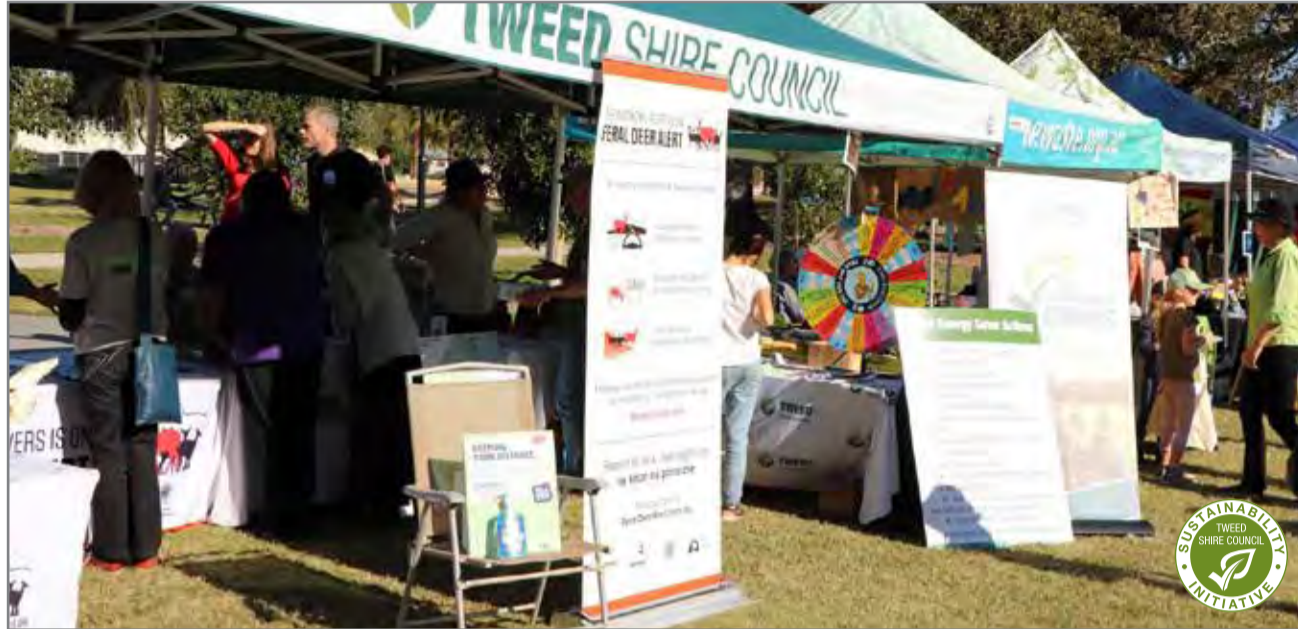
Visit Council's stall at World Environment Day this coming Sunday, 17 July from 10 am to 3 pm.

Tweed Shire Council wishes to recognise the generations of the local Aboriginal people of the Bundjalung Nation who have lived in and derived their physical and spiritual needs from the forests, rivers, lakes and streams of this beautiful valley over many thousands of years as the traditional custodians of these lands.