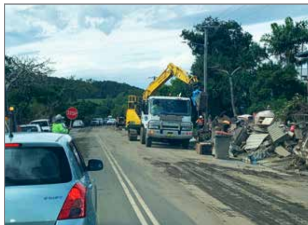
The clean-up of the streets in Tumbulgum has already begun.

For more information visit Council's website or follow Council's Facebook page at facebook.com/tweedshirecouncil for regular updates and the latest information for the flood clean-up timing and dates. For more information contact Council on 02 6670 2400.