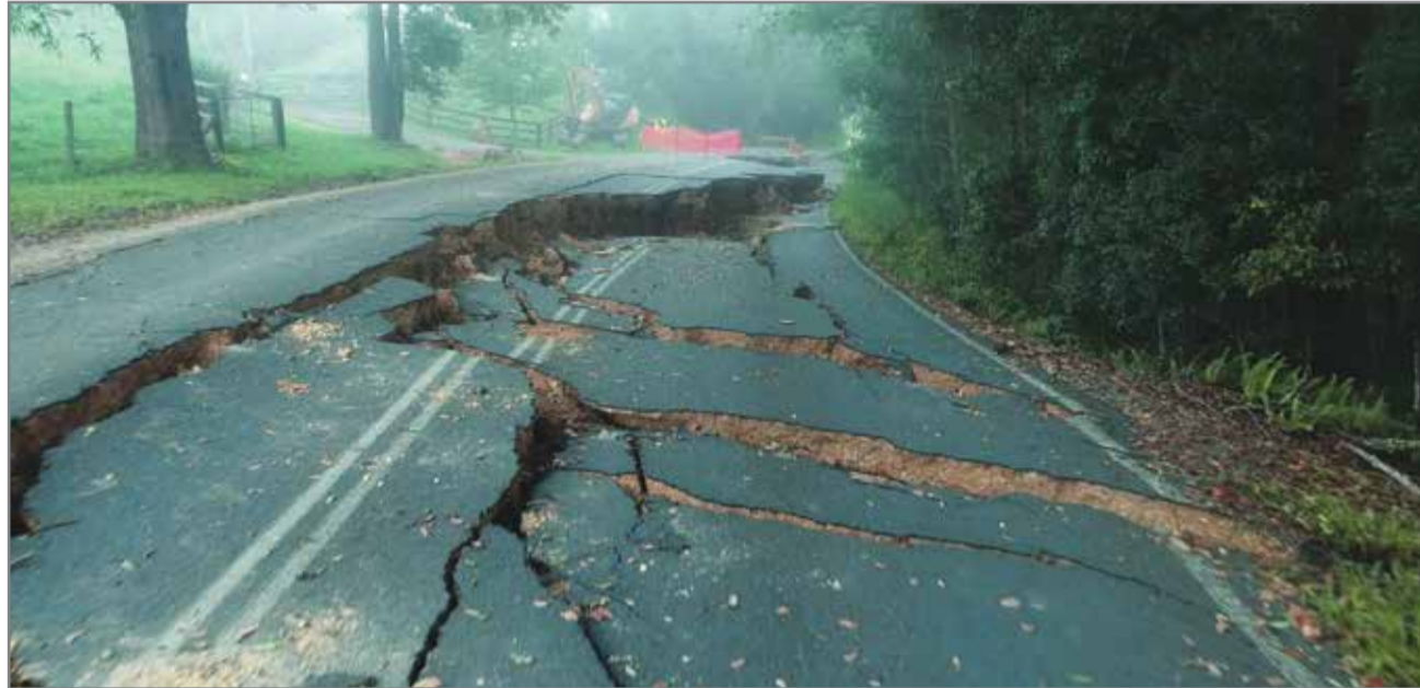
Tyalgum Road, about 4km east of Tyalgum village, is closed due to severe road damage caused by landslips.