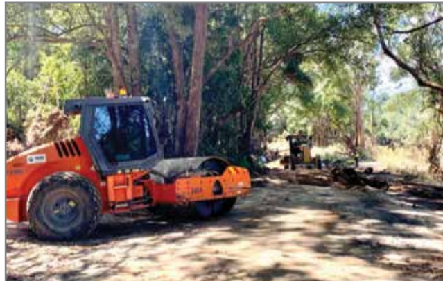
Temporary road repairs have begun on Mt Warning Road.

Several significant landslips – including on Tyalgum Road about 4km east of Tyalgum village, Scenic Drive at Bilambil Heights and Reserve Creek Road at Reserve Creek – are of major concern and these