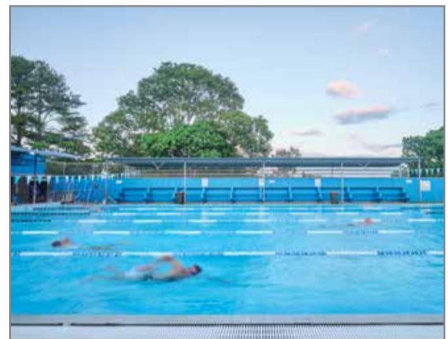
TRAC facilities at Kingscliff (above) and Tweed Heads South have returned to normal operating hours.

Updated hours for Murwillumbah pool at can be found at trac.tweed.nsw.gov.au/contactus and stay up to date with all of TRAC's facilities at trac.tweed.nsw.gov.au