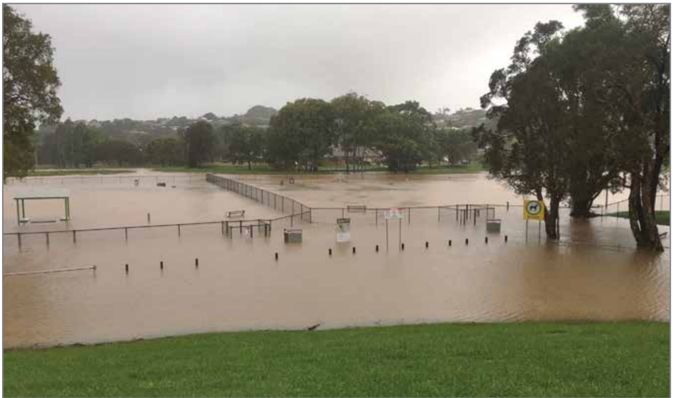
The new off-leash dog park at Banora Point completely inundated by flood water during the recent extreme weather event.

For more information contact Council on 02 6670 2400.