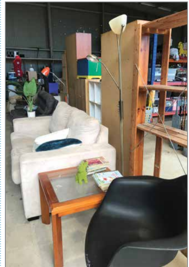
Find yourself a bargain at the Tweed JUNKtion (Tip shop Treasures).

Also know that the National Relay Service can help if you are deaf or find it hard to hear or speak to others. Visit infrastructure.gov.au/national-relay-service to find out more.