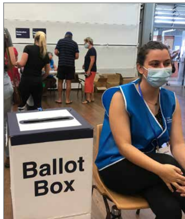
Residents casting their votes on Saturday 4 December 2021 at the Pottsville Beach Public School polling station.

For more information, visit the NSW Electoral Commission at elections.nsw.gov.au or phone 1300 135 736.