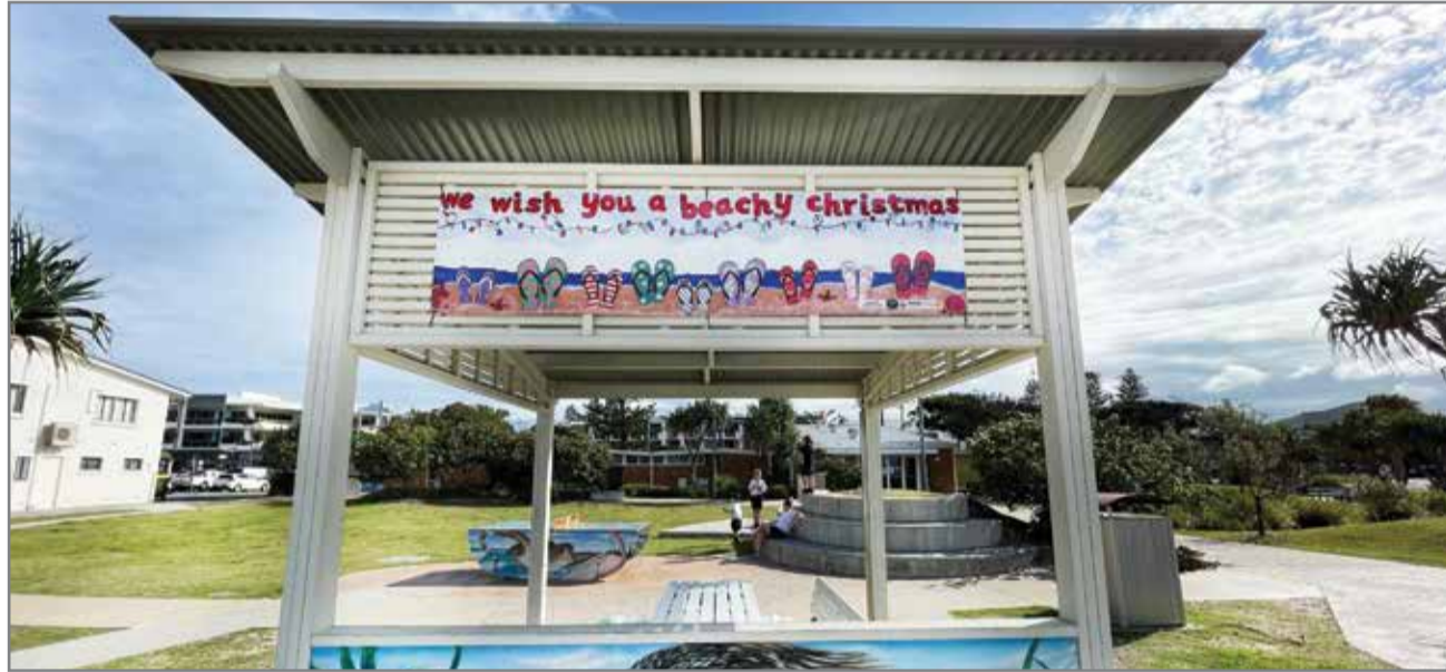
Head down to Rowan Robinson Park at Kingscliff to see Christmas-themed banners created by local primary school students.

Tweed Shire Council wishes to recognise the generations of the local Aboriginal people of the Bundjalung Nation who have lived in and derived their physical and spiritual needs from the forests, rivers, lakes and streams of this beautiful valley over many thousands of years as the traditional owners and custodians of these lands.