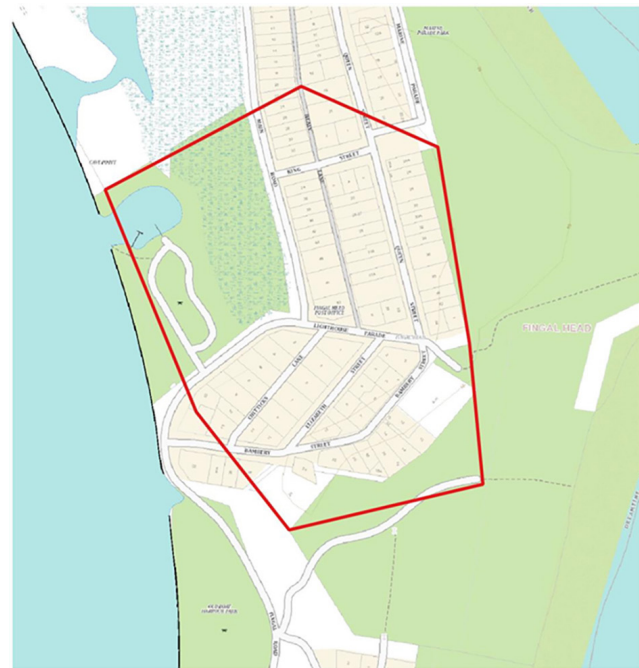
Fingal Village ACHA Study Area

Attachment A List of Lots and DPs for Fingal Village ACHA Study Area.