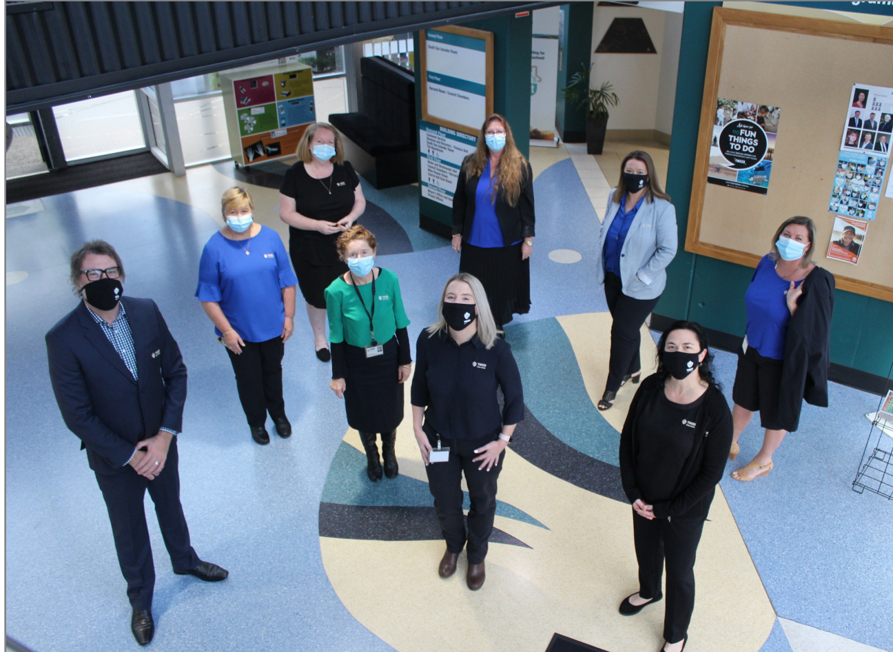
Council's Customer Contact Centre team members are here to help you, serving the community for 10 years.

Tweed Shire Council wishes to recognise the generations of the local Aboriginal people of the Bundjalung Nation who have lived in and derived their physical and spiritual needs from the forests, rivers, lakes and streams of this beautiful valley over many thousands of years as the traditional owners and custodians of these lands.