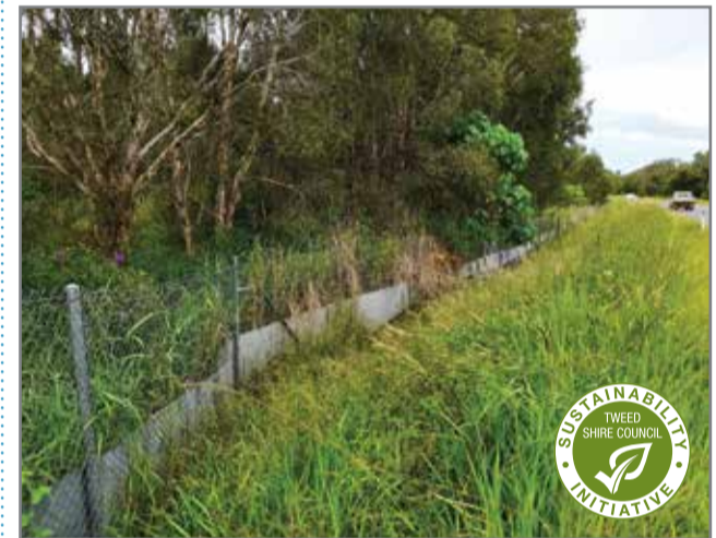
Repairs are set to be carried out on wildlife safety fencing along Tweed Coast Road near Casuarina next month, including vegetation works.

All proposed work has been assessed by Council's environmental scientists to ensure it can be carried out without any significant environmental impact.