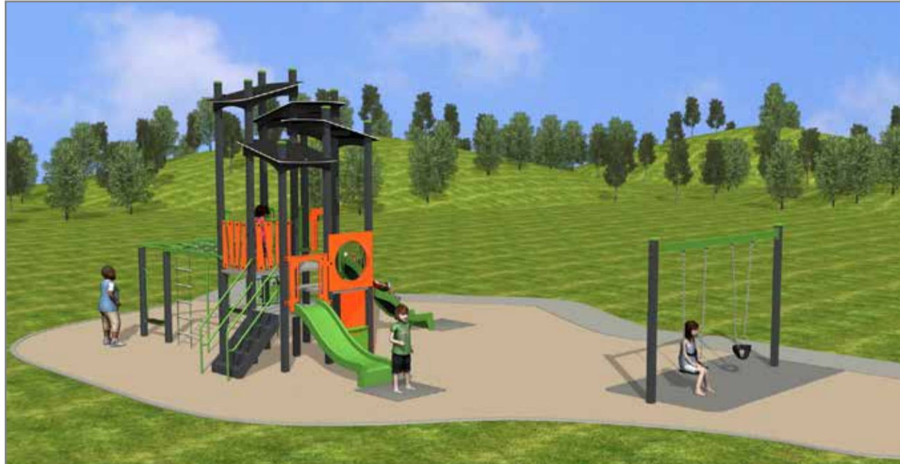
An artist's impression of the new play equipment set for Coral Street Park in Bilambil Heights.