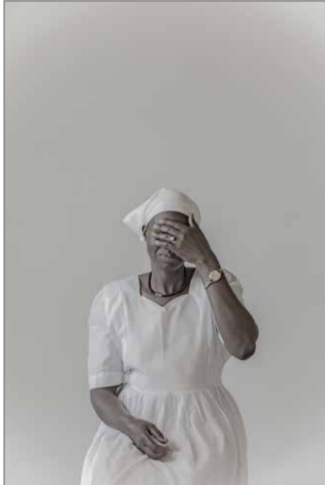
D-Mo (b.1977) Vice Versa 2021 Digital print on Hahnemühle photo rag. Acquired as the Winner of the Olive Cotton Award, 2021 © The artist

The free exhibition will run until Sunday 19 September 2021.