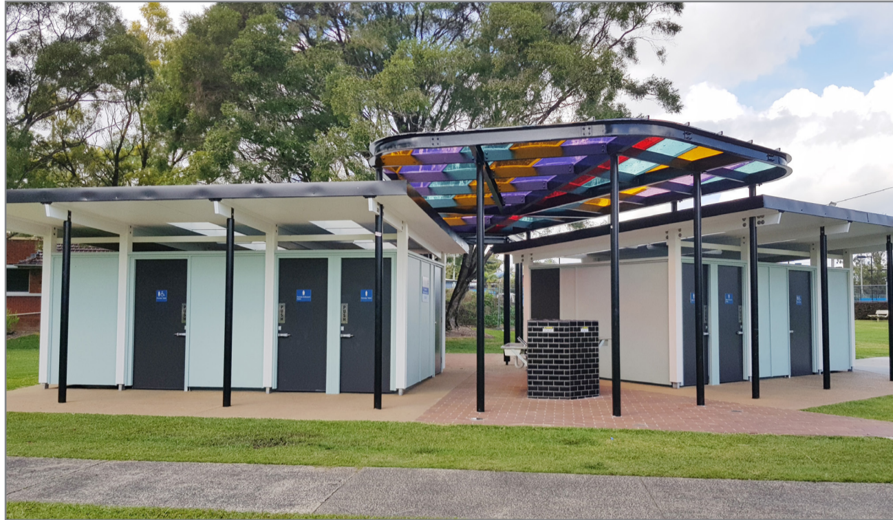
Council's new Public Toilet Strategy will ensure well-maintained, safe, conveniently located and accessible public toilets across the Tweed.

Tweed Shire Council wishes to recognise the generations of the local Aboriginal people of the Bundjalung Nation who have lived in and derived their physical and spiritual needs from the forests, rivers, lakes and streams of this beautiful valley over many thousands of years as the traditional owners and custodians of these lands.