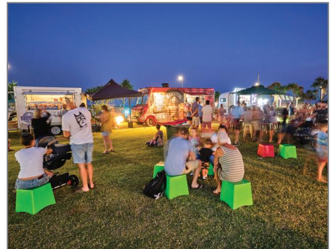
Come along to learn about what you need to operate a mobile food business in the Tweed.

Mobile food vendors, market operators and event organisers are invited to register for the event, which runs from 4 to 5:30 pm at eventworkshop-foodvans.eventbrite.com.au