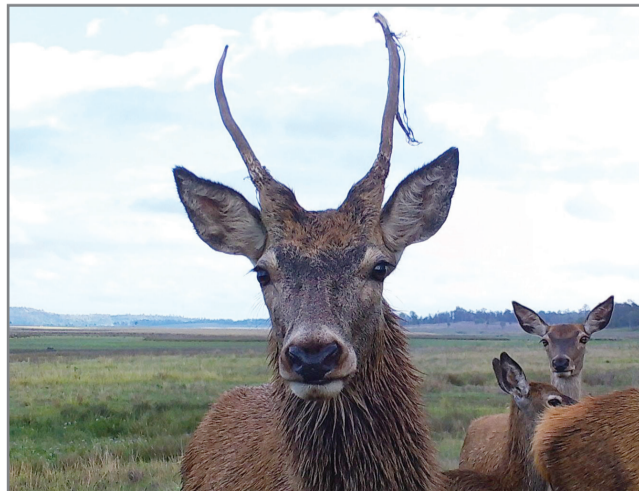
Workshops will be held at Tyalgum and Murwillumbah to address the looming threat of feral deer encroaching on the Tweed.