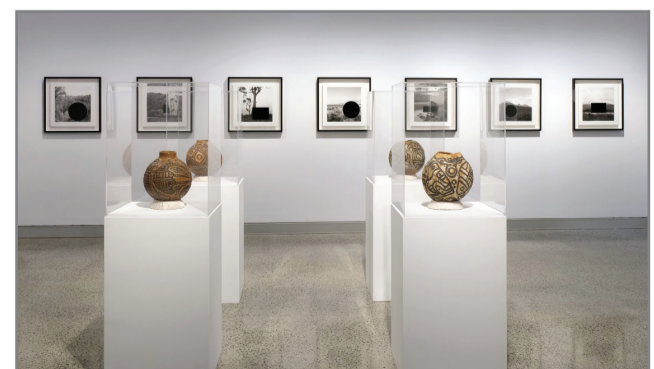
Void , installation view, Tweed Regional Gallery, 2021.