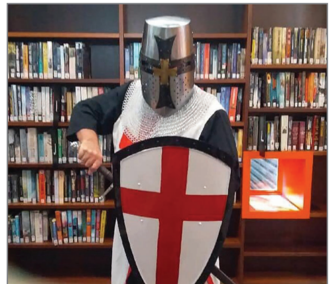
Sir Larry of the Library will make a special appearance at Kingscliff Library to mark its 21st birthday on Monday 28 June.

There will also be a limited amount of free craft handout for children. For more information contact Kingscliff Library on 02 6674 1607.