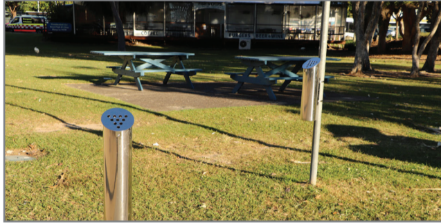
New cigarette butt bins have been installed at Jack Evans Boat Harbour at Tweed Heads to help reduce butt litter.