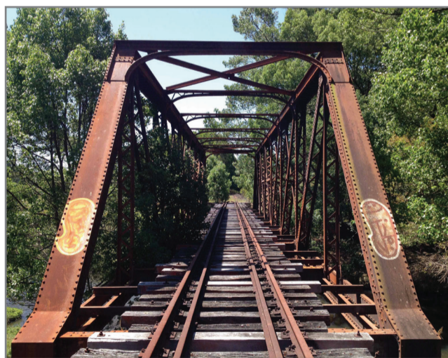
One of the 26 bridges along the Tweed section of the Northern Rivers Rail Trail.

Please note all children must be accompanied by an adult for all activities. Visit museum.tweed.nsw.gov.au/talksandevents for more information and ticketing links.