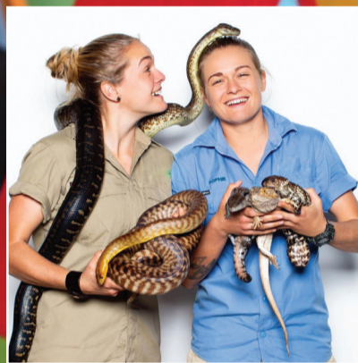
Paint and decorate your own bird house to take home or meet the Wildlife Twins (inset) at Tweed Regional Museum, Murwillumbah these school holidays.