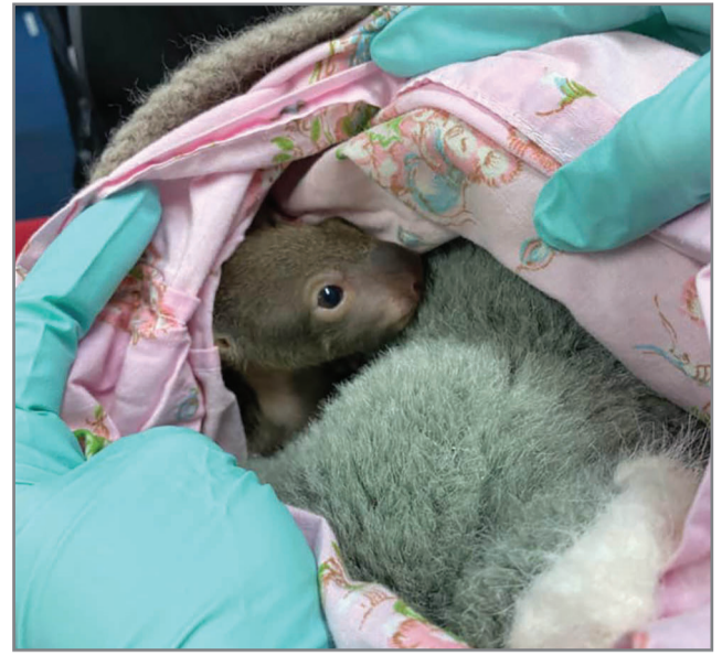
Koala joey Heath is being well cared for by staff at Currumbin Wildlife Hospital.

Report all koala sightings at tweed.nsw.gov.au/koalas